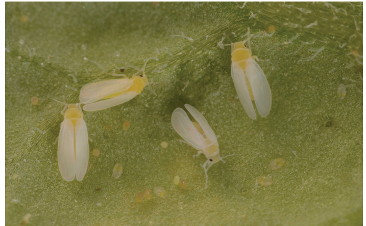
Figure 1. Newly emerged adult SWF with eggs and young nymphs.

lower down on the plant. Development from egg to adult can be as short as two weeks during warm weather.