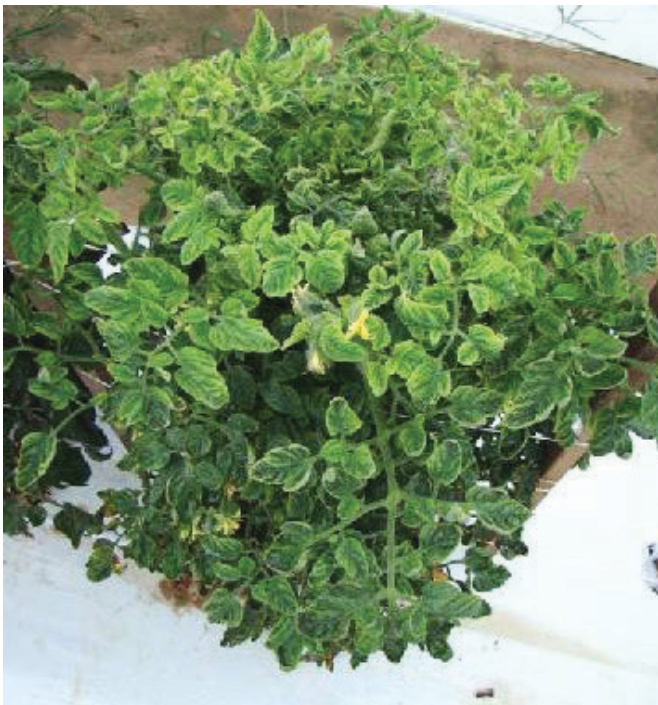
Figure 2. Tomato plant infected with Tomato yellow leaf curl virus . Credits: UF/IFAS

duration of life. TYLCV is common in Florida and causes severe stunting, shortened internodes, interveinal chlorosis, upward curled leaves, and flower abscission. Fruit set shuts down once a plant is infected, and early infection may result in little or no yield. Therefore, protecting young crops from whitefly attack is a priority.