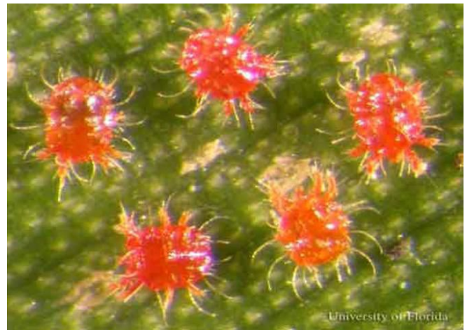
Figure 1. Adult females of the red palm mite, Raoiella indica Hirst.

Females of Raoiella indica average 245 microns (0.01 inches) long and 182 microns (0.007 inches) wide, are oval and reddish in color. Females develop dark markings on the dorsum of the body after feeding. The dorsum is smooth, except for the presence of punctae (sculptured depressions). The male is smaller, but similar to the female in shape except for having a tapering of the posterior end of the body.