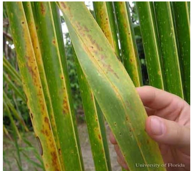
Figure 4. Close up of palm damage caused by the red palm mite, Raoiella indica Hirst.