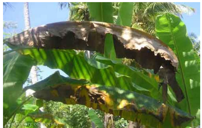
Figure 5. Damage to banana caused by the red palm mite, Raoiella indica Hirst.

Mites may be collected by visual examination of the individual plant or plant part under a dissecting microscope or by beating the plants over a sieve screen fitted to a plastic funnel with a vial attached to it. Both methods allow tenuipalps as well as predatory mites (Phytoseiidae) to be collected.