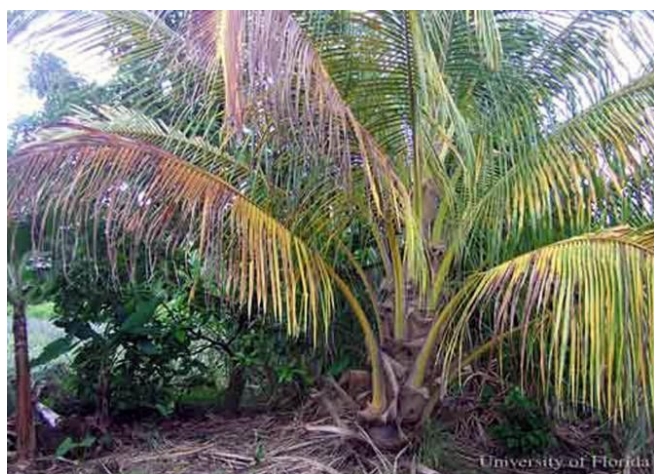
Figure 3. Severe damage to palm caused by the red palm mite, Raoiella indica Hirst.

In less than a year after its introduction to Martinique, the mite appeared on coconut palms on nearby islands. The presence of Raoiella indica populations on very tall and older coconut palms in St. Lucia strongly support the premise that the mite was primarily dispersed by wind currents. The mite is spreading to other exotic and ornamental palms. In Dominica, where coconut is grown with bananas, the mite shifted to this new host with numbers close to 200 mites/cm 2 . The lower leaves of banana and plantain turn yellow with small patchy green-yellow areas. Most of the mites are on the lower leaf of the host plant and the presence of yellow coloration on the upper surface of the leaf corresponds to the presence of a mite colony on the underside of the leaf.