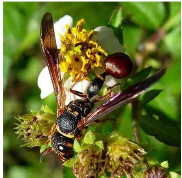
Figure 5. An adult male Zethus slossonae Fox. Notice apical curve on antenna that indicates a male. Image taken in Indian River County, Florida, so species is most likely Z. s. variegatus Say. Credit: Sean McCann, University of Florida

Zethus slossonae is most readily separated from Zethus spinipes by color: Zethus slossonae is black and red with yellow markings, while Zethus spinipes is black with ivory markings. Other morphological differences, not as readily apparent as color, are given by Isely (1917) and Bohart and Stange (1965).