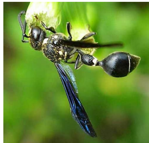
Figure 2. Lateral view of an adult Zethus spinipes Say.