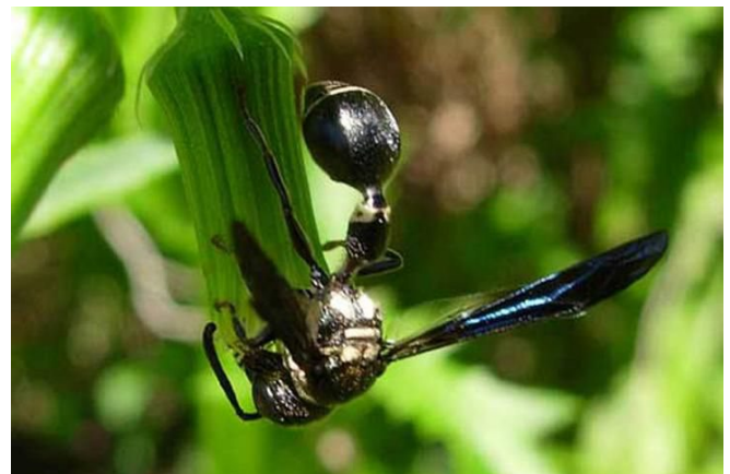
Figure 6. Dorsal view of an adult Zethus spinipes Say.