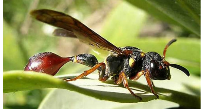
Figure 1. An adult male Zethus slossonae Fox. Notice apical curve on antenna that indicates a male. Image taken in Indian River County, Florida, so species is most likely Z. s. variegatus Say.

Zethus spinipes Say has two subspecies found in the eastern United States, and Zethus slossonae Fox is known from southern Florida. Zethus are easily mistaken for potter wasps ( Eumenes ) commonly found around the home. Unlike Eumenes spp. which build nests of mud, Zethus use either abandoned burrows of other insects or build nests from vegetable matter and resin.