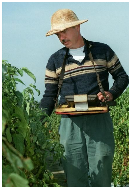
Figure 5. Regular scouting is critical when developing an IPM program.