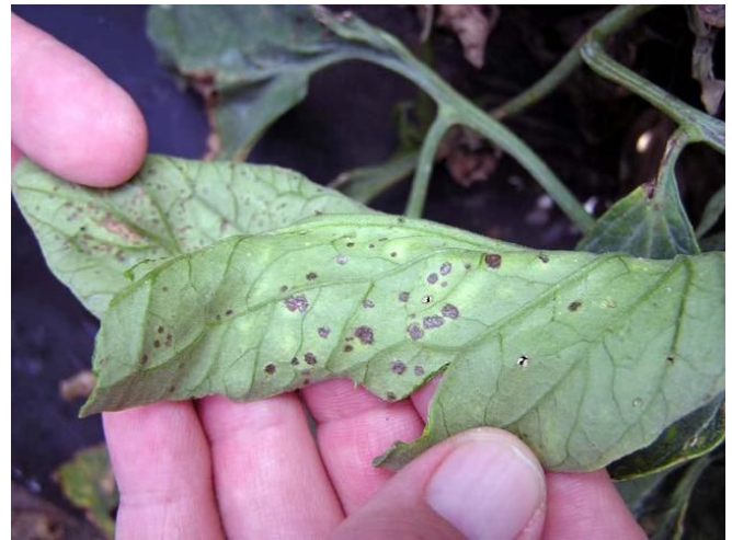
Figure 1. Bacterial leaf spot is one of the key diseases of both pepper and tomato. Although there are only a few primary pests of tomato or pepper, about 27 insects, nearly 30 pathogens, several weeds, and two nematodes can significantly reduce tomato production.