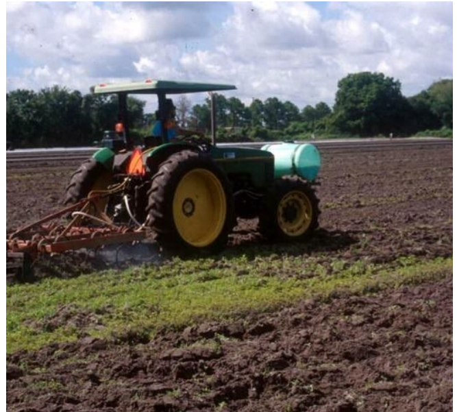
Figure 3. Cultural practices have been instituted to reduce whitefly exposure to neonicotinoids, such as crop or host free periods and sod-based rotations with bahia, pangola and digit grasses. These methods, plus selected herbicides, also help reduce the impact of weeds.

best available technologies for reducing pest risk in their farming systems while maintaining economic viability.