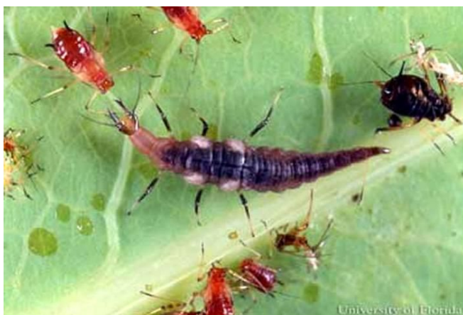
Figure 6. There are many ways to implement integrated pest management, such as using lacewing larvae to control aphids.

Vegetable growers in Florida currently use a variety of IPM practices and many have expressed their willingness to incorporate new tactics when provided with sufficient information.