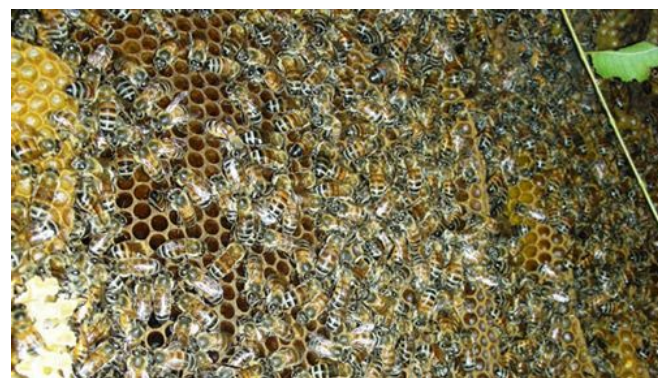
Figure 1. Adult African honey bees, Apis mellifera scutellata Lepeletier, on comb in colony.

The African honey bee, Apis mellifera scutellata Lepeletier, is a subspecies (or race) of the western honey bee, A. mellifera Linnaeus, that occurs naturally in sub-Saharan Africa but has been introduced into the Americas. More than 10 subspecies of western honey bees exist in Africa and all justifiably are called "African" honey bees. However, the term "African (Africanized) honey bee" refers exclusively to A.m. scutellata in the bee's introduced range.