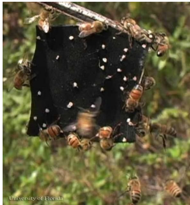
Figure 9. Defensive African honey bees, Apis mellifera scutellata Lepageletier, stinging black cloth and leaving behind stinger and venom sacs.

needs to get away from that nest as quickly as possible. It is important that the victim get cover in a bee-proof vehicle or structure if either is available. One should not jump into the water or hide in bushes. The bees can remain defensive and in the area for some period of time, thus increasing the risk to the victim. If stung, the victim should remove the stinger quickly by scraping it rather than by pulling it. One should see a doctor immediately if breathing is affected.