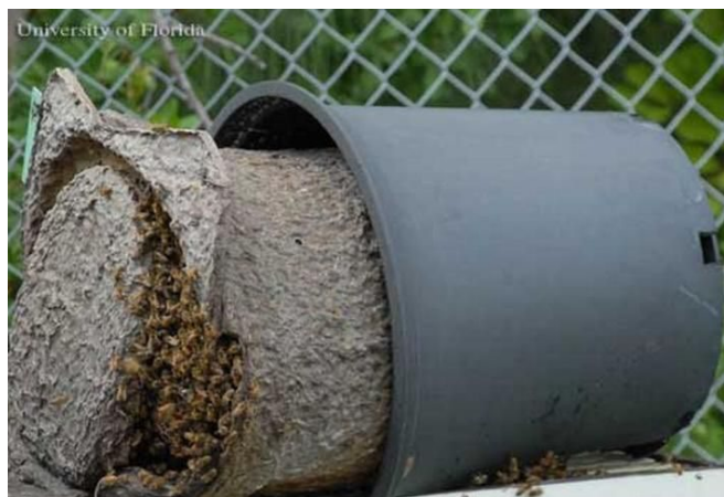
Figure 8. African honey bee, Apis mellifera scutellata Lepageletier, colony that has established itself in a swarm trap.

Due to their heightened defensive behavior, African honey bees can be a risk to humans. Children, the elderly, and some disabled individuals are at the highest risk of a deadly attack due to their inability or hampered ability to escape an attack. African honey bees are agitated by vibrations like those caused by power equipment, tractors, lawnmowers, etc. Further, their nesting habits often put them in close proximity to humans. Because of this, precautions should be taken in an area where Africanized honey bees have been established. These precautions are not suggested to make people fearful of honey bees but only to encourage caution and respect of honey bees. The precautions include remaining alert for honey bees flying into or out of an area (suggesting they are nesting nearby), staying away from a swarm or nest, and having wild colonies removed from places that humans frequent. The latter is perhaps the most important advice one can heed when dealing with African bees. In the US, a large percentage of African bee attacks occur on people who know a nest is present but elect not to have it removed (or try to do it themselves).