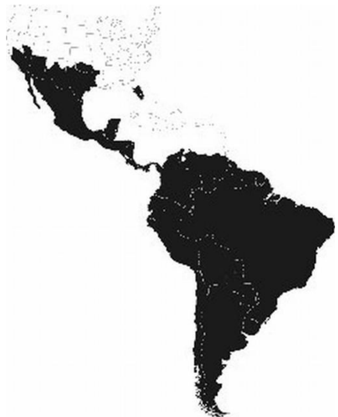
Figure 4. Distribution of Apis mellifera scutellata in the Americas as of 2007.