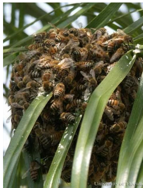
Figure 6. African honey bee, Apis mellifera scutellata Lepeletier, swarm on palm fronds.