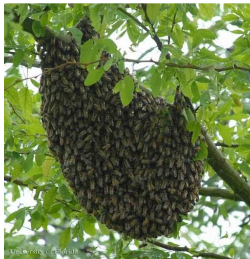
Figure 5. African honey bee, Apis mellifera scutellata Lepeletier, swarm in tree.

Another behavioral difference between African and European bees concerns colony level reproduction and nest abandonment. African honey bees swarm and abscond in greater frequencies than their European counterparts. Swarming, bee reproduction at the colony level, occurs when a single colony splits into two colonies, thus helping to ensuring survival of the species. European colonies commonly swarm one to three times per year. African colonies may swarm more than 10 times per year. African swarms tend to be smaller than European ones, but the swarming bees are docile in both races. Regardless, African colonies reproduce in greater numbers than European colonies, quickly saturating an area with African bees. Further, African bees abscond frequently (completely abandon the nest) during times of dearth or repeated nest disturbance, while this behavior is atypical in European bees.