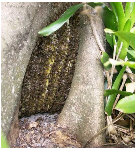
Figure 7. An African honey bee, Apis mellifera scutellata Lepeletier, colony between buttress roots of a tree.

Other behavioral differences between African and European races exist and are worth discussing briefly. For example, African bees are often more "flighty" than European bees, meaning that when a colony is disturbed, more of the bees leave the nest rather than remain in the hive. African bees use more propolis (a derivative of saps and resins collected from various trees/plants) than do European bees. Propolis is used to weather-proof the nest and has various antibiotic properties. African colonies produce proportionally more drones (male bees) than European bees. Their colonies grow faster and tend to be smaller than European colonies. Finally, they tend to store proportionately less food (honey) than European bees, likely a remnant of being native to an environment where food resources are available throughout the year.