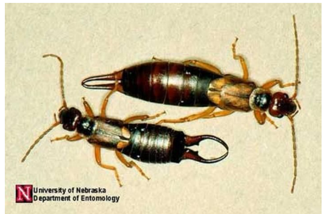
Figure 1. Adult male (bottom) and female (top) European earwigs, Forficula auricularia Linnaeus. The forceps help determine the sex of the adult.

The adult normally measures 13–14 mm (~1/2 in) in length, exclusive of the pincher-like cerci (forceps), though some individuals are markedly smaller. The head measures about 2.2 mm (~1/16 in) in width. Adults, including the legs, are dark brown or reddish brown in color, though paler ventrally. The antennae have 14 segments. Despite the appearance of being wingless, adults bear long hind wings folded beneath the abbreviated forewings. Although rarely observed to fly, when ready to take flight the adults usually climb and take off from an elevated object. The hind wings are opened and closed quickly, so it is difficult to observe the wings.