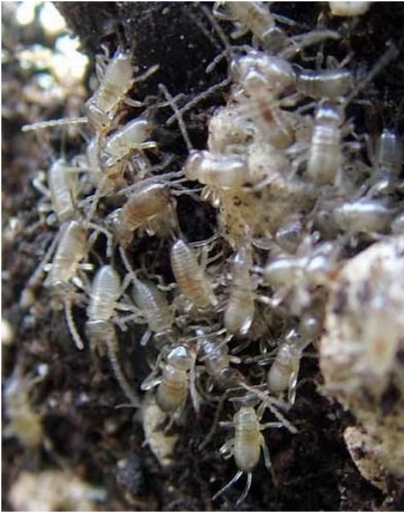
Figure 4. Immature (early instar—first?) European earwigs, Forficula auricularia Linnaeus.