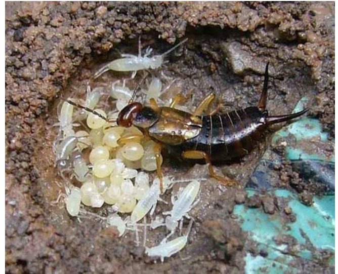
Figure 3. Adult female European earwig, Forficula auricularia Linnaeus, with eggs and young. Photographed in Chester, United Kingdom.

The egg is pearly white in color and oval to elliptical in shape. The egg measures 1.13 mm (~1/32 in) in length and 0.85 mm (< 1/32 in) in width when first deposited, but it absorbs water, swells, and nearly doubles in volume before hatching. Eggs are deposited in a cell in the soil in a single cluster, usually within 5 cm of the surface. The mean number of eggs per cluster is reported to range from 30 to 60 eggs in the first cluster. The second cluster, if produced, contains only half as many eggs. Duration of the egg stage under winter field conditions in British Columbia averages 72.8 days (range 56–85 days). The second or spring brood of eggs requires only 20 days to hatch. Eggs are attended by the female, who frequently moves the eggs around the cell and apparently keeps mold from developing on the eggs (Buxton and Madge 1974). Females guard their eggs from other earwigs and fight with any intruders.