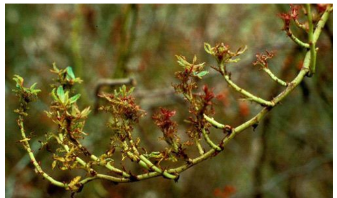
Figure 2. Feeding by the mite Phyllocoptes fructiphilus results in transfer of the virus to roses. Mites prefer to feed on tender new growth, and the virus modifies plant development to produce red foliage and stems, excessive thorniness, witches broom of shoots, and, ultimately, death. The mites are typically found in the apex of the rose shoots, where they feed and reproduce.

Rose Rosette Disease causes red coloration of new growth, excessive thorniness, elongated shoots, deformed blooms, witches broom of shoots (Figure 2) and, ultimately, death of the plant. Rose Rosette Disease does not appear to be transmitted mechanically, although disinfecting all tools used on infected roses may be a useful precautionary effort. The virus does not survive well in soil, but the virus may survive in rose roots in the soil, so all roots should be removed from the soil when infected roses are removed. The disease somewhat resembles damage caused by herbicides, so diagnosis by PCR for the virus or by presence of the mites is helpful in discriminating between herbicide damage and RRD.