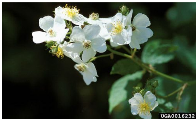
Figure 3. Multiflora rose, Rosa multiflora , is a noxious weed in many states and the mite and RRD have been suggested as biological control agents for this weed. Unfortunately, the mite also attacks ornamental roses so it is no longer considered a potential multiflora weed control agent.

This mite can be spread by the wind and by contaminated clothing and equipment. It also is possible that it can disperse through phoresy (attaching itself to insects). As a result, the distribution of the mite and RRD is expanding.