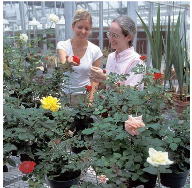
Figure 6. Cultivars of roses are grown for their beauty and scent. Thousands of different rose cultivars have been developed through breeding.