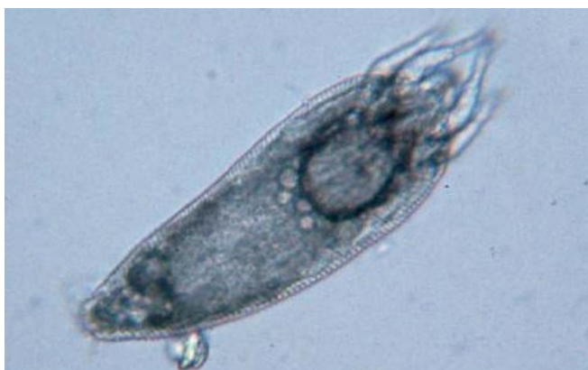
Figure 1. Phyllocoptes fructiphilus Keifer is a tiny eriophyid mite and cannot be seen without magnification. Like all eriophyid mites, it has only two pairs of legs at the anterior of its worm-like body.

Phyllocoptes fructiphilus Keifer is a tiny eriophyid mite associated with most rose species and cultivars, especially in the eastern half of the US. Most significantly, this mite is the vector of a devastating viral disease of roses called Rose Rosette Disease (RRD). This virus is a negative-strand RNA virus in the Emaravirus genus, which includes Fig mosaic virus , Raspberry leaf blotch virus , Pigeonpea sterility mosaic virus and High Plains disease of maize and wheat, all of which are transmitted by other eriophyid mite species. The genome of this virus has been partially sequenced, which may allow geneticists to develop cultivars of roses that are resistant to RRD. The disease diagnosis can be confirmed with a molecular test called the polymerase chain reaction (PCR).