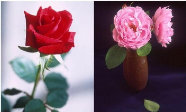
Figure 5. Cultivars of roses are grown for their beauty and scent. Thousands of different rose cultivars have been developed through breeding.

Roses are valued for their beauty and scent, and the rose is the national flower of the US. Cut roses, rose bushes, and rose oil are commercially valuable. Commercial rose producers plant tens of thousands of roses each year. Cultivation is highly labor-intensive due to the fact that pruning, spraying, fertilizing, and harvesting are done by hand. Rose production employs workers in farming, transportation, marketing, and delivery to wholesale and retail markets. Internationally, the cut floral industry, of which roses account for two-thirds of all such plants, exceeds $40 billion dollars per year. There is no guarantee that RRD and the mite vector can be contained in the US due to the export of roses around the world, so the economic impact of this mite and the disease it transmits could increase.