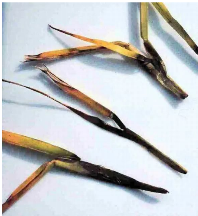
Figure 1. Base of leaf is rotted due to brown patch.

This disease usually begins as small patches (about 1 ft in diameter) that turn yellow and then reddish brown, brown, or straw colored as the leaves start to die. Patches can expand to several feet in diameter (Figure 2). It is not uncommon to see rings of yellow or brown turf with apparently healthy turf in the center. Turf at the outer margin of a patch may appear dark and wilted (Figure 3).