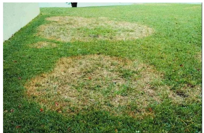
Figure 2. Brown patch symptoms on St. Augustinegrass.