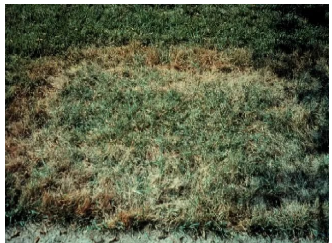
Figure 3. Brown patch symptoms on zoysiagrass. Note that the outer edge is a darker color indicating the fungus is active at this point.