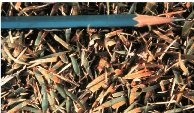
Figure 1. Rust symptoms on zoysiagrass.

Symptoms/Signs: Initially, light yellow flecks appear on the leaves. If the disease progresses, these flecks enlarge into spots that are parallel to the leaf vein. Eventually, orange pustules (spots) containing spores form (Figure 1). These pustules are parallel to the leaf vein. The spores rub off when touched (Figure 2). Heavily infected areas appear thin and chlorotic (yellow to light brown). The disease may give the turfgrass an ugly appearance, but it will not kill the turfgrass.