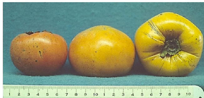
Figure 13. 'Hanagoshu' cultivar.

' Hanagoshu ' is a large tree with vigorous upright growth and a strong scaffold system (Figure 13). The tree will usually have a small amount of male flowering every year, and crop regulation is good. The fruit and leaves are slightly more susceptible to late-season pathogens than most cultivars. 'Hanagoshu' is a large tree and a good homeowner cultivar.