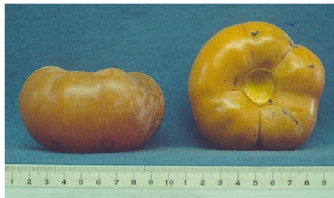
Figure 21. 'Sheng' cultivar.

'Sheng' is a well-spreading tree with large fruit having lobed sections looking somewhat like a 4- or 6-leaf clover from the top (Figure 21). Fruit have a high jelly content, are bright orange, and when pollinated will set many seed.