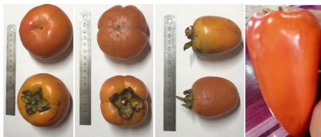
Figure 3. Different fruit shapes among persimmon cultivars.

The three general fruit shapes are conic (cone-shaped), roundish (round and sometimes pointed at the apex like an acorn), and oblate (flattened like a large standard tomato) (Figure 3). Some cultivars have other noticeable characteristics, such as an indented ring around the fruit of 'Midia' and 'Tamopan'. Four sides will sometimes be apparent on fruit of 'Great Wall' or 'Saijo'. Distinctly lobed sections are present on 'Sheng' and 'Peiping'. Some cultivars are tucked or folded in at the calyx, like 'Suruga'.