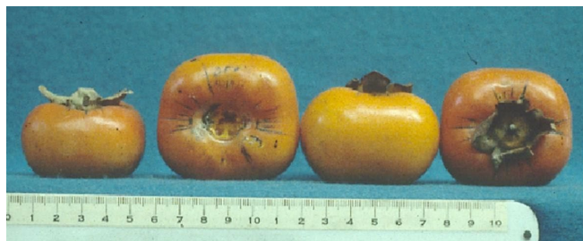
Figure 26. 'Great Wall' cultivar.

'Great Wall' is a strong-growing, small, 4-sided fruit (Figure 26). The flesh is dry, similar to 'Tanenashi', but of excellent quality. It grows on an upright tree.