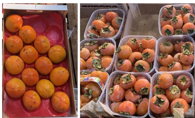
Figure 4. Fruit size among persimmon cultivars can be varied from 3.5 oz (100 g) to 14 oz (400 g).

Fruit size is affected by crop loads. The lighter the crop set, the larger the fruit. Small fruit generally weigh 3.5 oz (100 g) to 4.5 oz (130 g), medium fruit range from 5.5 oz (150 g) to 7.0 oz (200 g), and large fruit range from 8 oz (230 g) to 14 oz (400 g) (Figure 4).