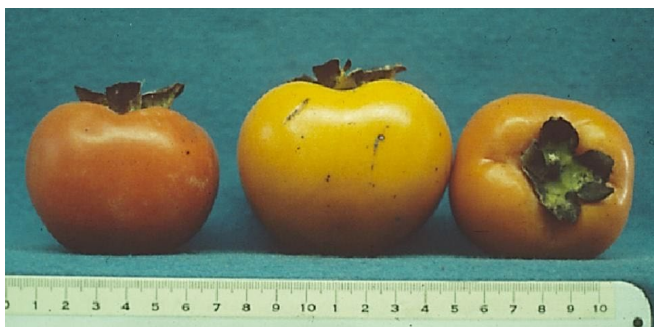
Figure 20. 'Eureka' cultivar.

'Eureka' has been widely propagated by southern nurseries and is a common cultivar in Texas (Figure 20). It has a large, round, flat-shaped, pollination-variant fruit with a medium amount of dark flesh around the seed.