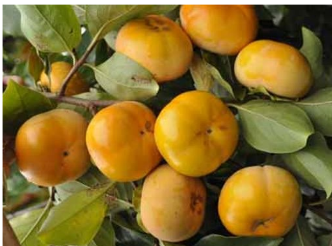
Figure 8. 'Ichikikei Jiro' cultivar. Credit: Edible Landscaping LLC

' Ichikikei Jiro ' is a bud sport of Jiro and is low to moderate in vigor (Figure 8). It blooms later than most persimmon cultivars. Fruit size is medium-large with soluble solids of 16% to 19%. Some fruit sustain tip cracking. Fruit are oblate. Harvest season is mid-October to mid-November. 'Ichikikei Jiro' is recommended for north and north central Florida.