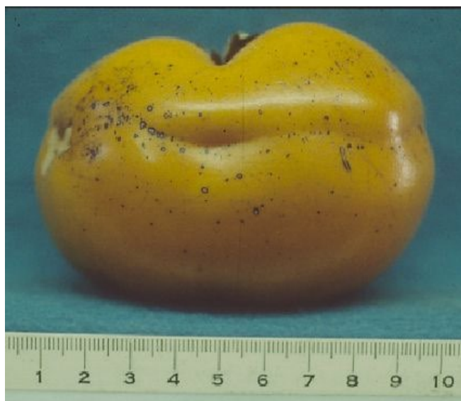
Figure 27. 'Tamopan' cultivar.

'Tamopan' is a cultivar with large fruit having a circular depression around the top third nearest the stem (Figure 27). The fruit is juicy, watery, and stringy, with a thick peel. More than one cultivar of this tree exists, some of which have better fruit than the one described.