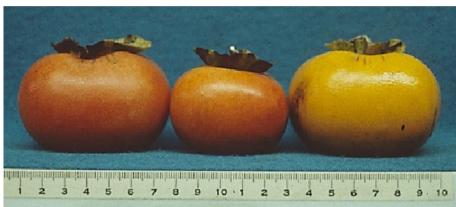
Figure 25. 'Hiratanenashi' cultivar

'Hiratanenashi' is a widely grown commercial cultivar in Japan (Figure 25). The fruit have a thick peel and a long shelf life. The flesh is juicy, somewhat watery, and almost always seedless. The astringency is sometimes difficult to remove after the fruit have been harvested unless they are artificially treated.