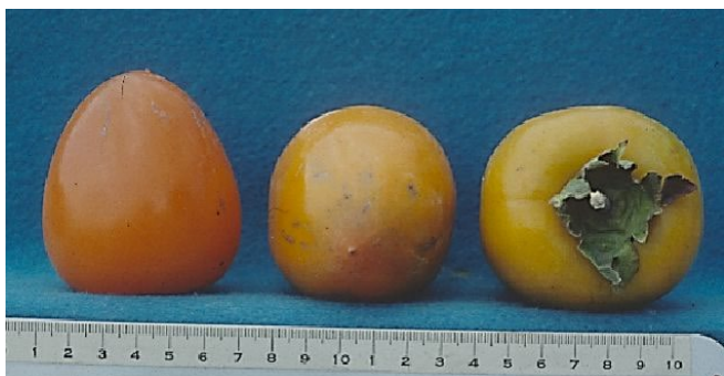
Figure 19. 'Giombo' cultivar.

'Giombo' is similar to 'Saijo' in fruit quality, although the fruit are much larger and begin ripening 2 weeks later (Figure 19). Fruit are light translucent orange and thin-peeled with a sweet, juicy, jelly-type flesh. 'Giombo' fruit are a connoisseur's choice. The tree is early to start growth in the spring and is sometimes injured by freezing temperatures.