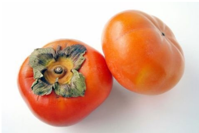
Figure 9. 'Jiro' cultivar.

season is mid-October through mid-November. 'Jiro' is recommended.