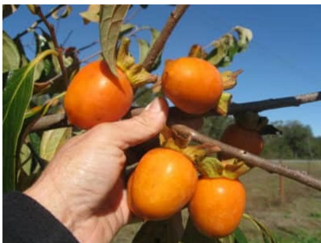
Figure 28. 'Ormond' cultivar.