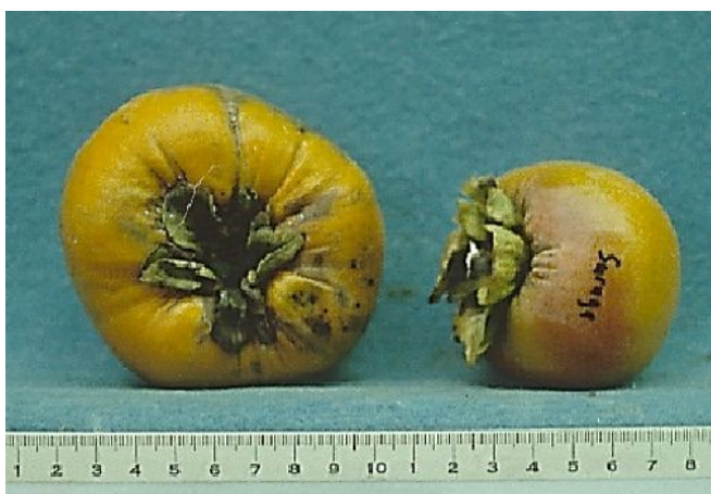
Figure 16. 'Suruga' cultivar.

'Suruga' trees are moderate in vigor (Figure 16). They produce late-ripening fruit that are exceptionally sweet (soluble solids = 18%–21%). Their fruit shape is classified as oblate conic, and fruit imperfections are fairly common. Fruit size is medium large. Harvest season is late November to early December. It appears to be susceptible to premature defoliation. 'Suruga' is not recommended for commercial cultivation.