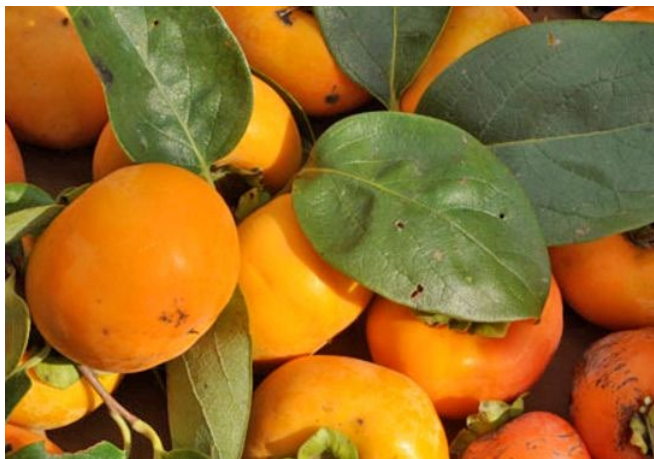
Figure 7. 'Matsumoto Wase Fuyu' cultivar.

produces heavy, clustered crops. The clusters should be thinned to prevent bent limbs with excessive fruit loads. Larger fruit are sometimes prone to calyx separation. The tree is moderately vigorous and of medium size. Soluble solids range from 16% to 19%, which is generally true for most mid-season types. Fruit is medium in size and oblate in shape. There is little or no tendency for fruit to incur tip cracking.