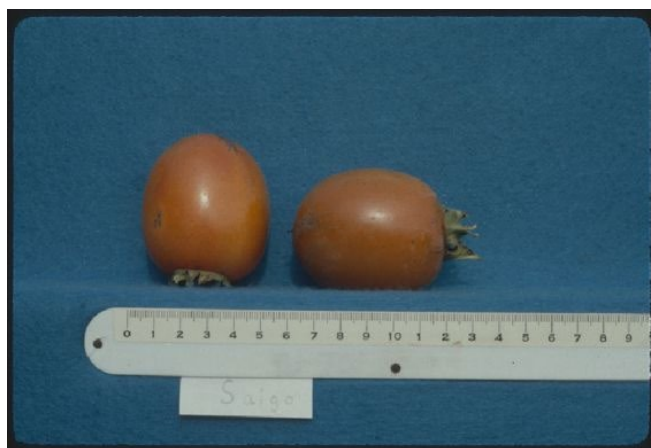
Figure 18. 'Saijo' cultivar.

'Saijo' is considered one of the sweetest persimmons, although traces of astringency sometimes remain when the fruit is soft (Figure 18). Fruit ripen early to mid-season and are relatively small with a long conic shape, and a translucent orange jelly-type flesh. Soluble solids range from 16% to 22%. The large, upright, vigorous tree is capable of producing heavy yields. It is a good homeowner type.