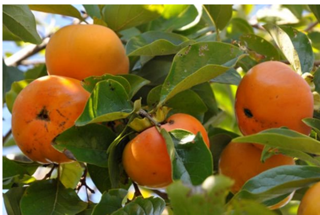
Figure 10. 'Makawa Jiro' cultivar.

' Maekawa Jiro ', a bud sport of Jiro, is low to moderate in vigor (Figure 10). Fruit size is large, and fruit shape is oblate. There is some tendency for fruit to incur tip cracking. Harvest season is mid-October to mid-November. 'Makawa Jiro' is not recommended for north and north central Florida.