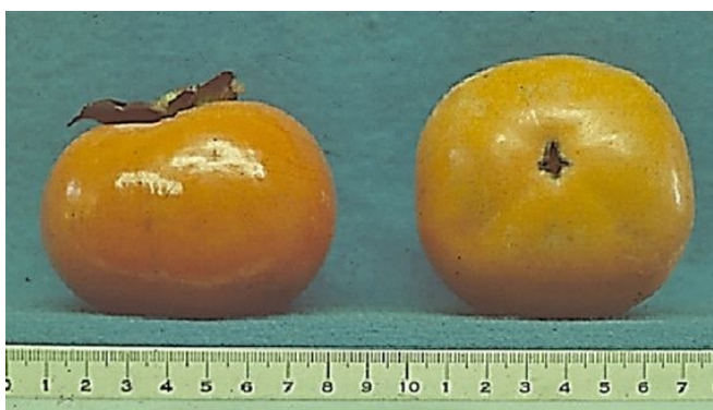
Figure 12. 'Hana Fuyu' cultivar.

' Hana Fuyu ', also known as 'Yotsundani', or 'Giant Fuyu', regulates crop loads well and is of medium vigor (Figure 12). The fruit are slightly larger than most, are generally free of imperfections, and may be slow to lose astringency. The tree is a good homeowner cultivar.