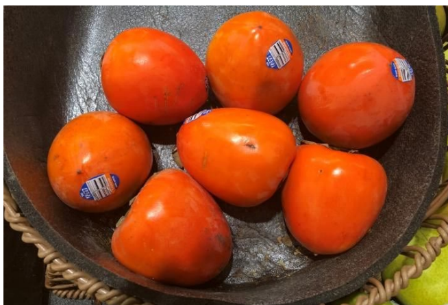
Figure 24. 'Hachiya' cultivar.

'Hachiya' is a commercial cultivar in California (Figure 24). Ability to set and hold fruit is sometimes a problem if this cultivar is propagated onto Diospyros virginiana rootstock. The fruit are high quality and jelly-fleshed, with an attractive red skin coloration. Fruit will often have concentric ring cracking at the apical end and will ripen unevenly starting from these points. In Japan, 'Hachiya' is mostly used for drying. It remains astringent until fully ripened and soft.