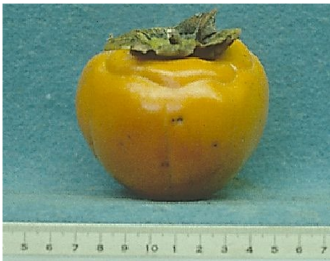
Figure 11. 'Midia' cultivar.

' Hana Fuyu ', also known as 'Yotsundani', or 'Giant Fuyu', regulates crop loads well and is of medium vigor (Figure 12). The fruit are slightly larger than most, are generally free of imperfections, and may be slow to lose astringency. The tree is a good homeowner cultivar.