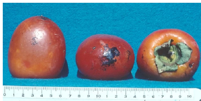
Figure 22. 'Yomato Hyakume' cultivar.

'Yomato Hyakume' is a pollination-variant type, but it does not have a great deal of dark flesh around the seeds. The fruit are large, with a deep orange-red color (Figure 22). Concentric ring cracking often occurs. This cultivar is a heavy annual cropper with good fall leaf retention. It is excellent for dried fruit and is one of the best astringent types.