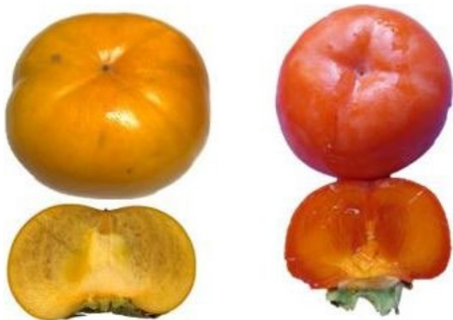
Figure 1. Nonastringent persimmon 'Fuyu' (left) and astringent 'Hiratanenashi' (right) ready-to-eat cultivars.