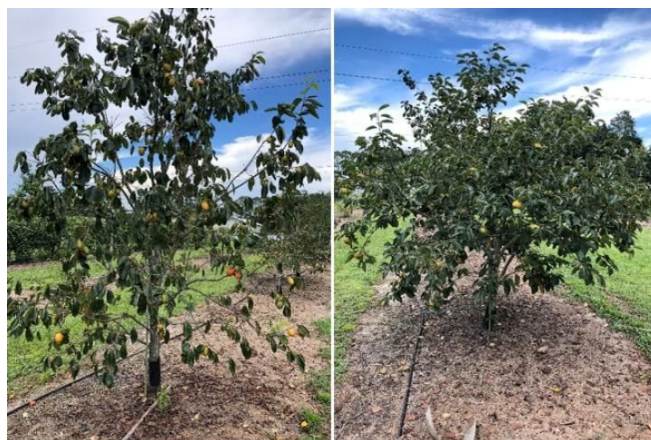
Figure 5. Tree size and shape can be varied among cultivars 'Saijo' (left) and 'Fuyu' (right).

most persimmon trees fall into this category. Trees in the tall class are upright and often have small fruit. Generally, tree size is reduced south of Gainesville to south Florida. It has been observed that trees grown in Florida are often smaller than would be expected in their native land; common cultivars barely reached 10 ft in height after 10 years in trials during the 1960s.