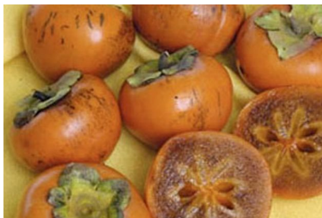
Figure 17. 'Nishumura Wase' cultivar

'Nishumura Wase' is an early cultivar, ripening its first fruit in early August (Figure 17). It is pollination variant and must be fully seeded to be nonastringent. It consistently sets male flowers. The fruit have soluble solids around 13% to 15% and are somewhat watery. The tree is well-spreading, somewhat vigorous, and a good annual cropper.