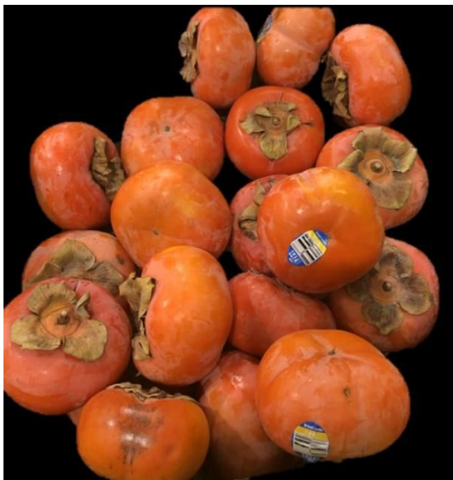
Figure 15. 'Fuyu' cultivar.

'Suruga' trees are moderate in vigor (Figure 16). They produce late-ripening fruit that are exceptionally sweet (soluble solids = 18%–21%). Their fruit shape is classified as oblate conic, and fruit imperfections are fairly common. Fruit size is medium large. Harvest season is late November to early December. It appears to be susceptible to premature defoliation. 'Suruga' is not recommended for commercial cultivation.