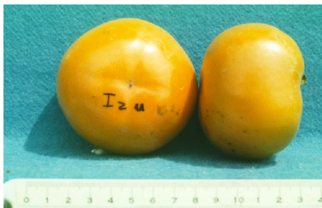
Figure 6. 'Izu' cultivar.

'Izu' has the distinction of being the earliest ripening nonstringent cultivar (Figure 6). Tree vigor is very low, and it is not precocious. Fruit size is medium-large, and soluble solids average 16%. Fruit shape is oblate, and a fair percentage of fruit show imperfections. Harvest season is late September through mid-November. 'Izu' is sometimes recommended due to early ripening.