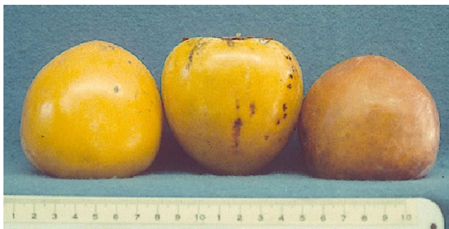
Figure 23. 'Tanenashi' cultivar.

'Hachiya' is a commercial cultivar in California (Figure 24). Ability to set and hold fruit is sometimes a problem if this cultivar is propagated onto Diospyros virginiana rootstock. The fruit are high quality and jelly-fleshed, with an attractive red skin coloration. Fruit will often have concentric ring cracking at the apical end and will ripen unevenly starting from these points. In Japan, 'Hachiya' is mostly used for drying. It remains astringent until fully ripened and soft.