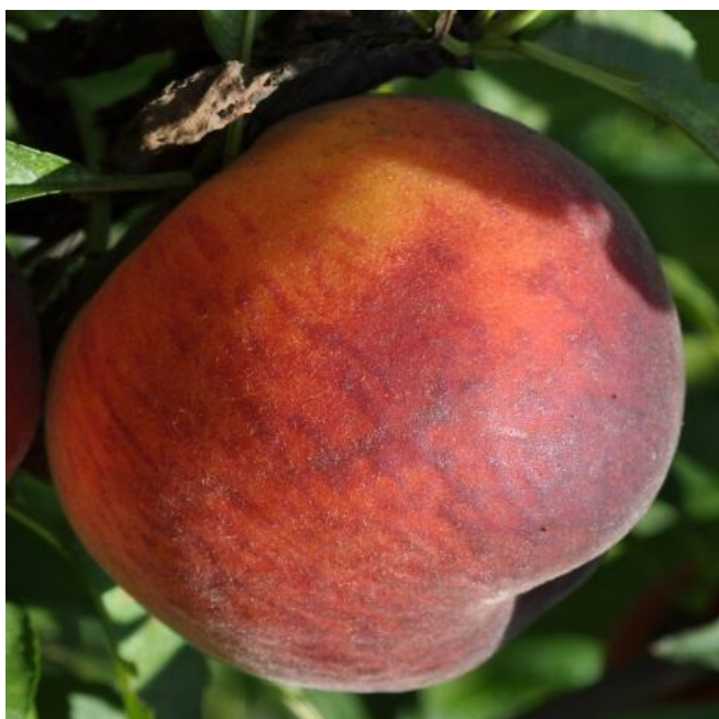
Figure 22. 'UFBlaze'

'UFBlaze' is a non-melting-flesh, clingstone peach cultivar released in 2002. Trees are highly vigorous, with a semi-spreading nature. 'UFBlaze' trees produce heavy annual crops of large, early ripening, attractive fruit with bright red skin over 80–90% of a bright yellow-orange background and yellow flesh. Fruit are uniform and symmetrical, and they ripen about 7 to 10 days after 'UFGold' in early to mid May in Gainesville, Florida with an FDP of 83 days (Figure 22).