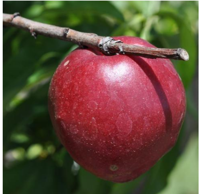
Figure 31. 'Suncoast'

'Suncoast' is a non-patented melting-flesh nectarine cultivar released in 1995. 'Suncoast' trees are vigorous and semi-spreading. Fruit of 'Suncoast' have yellow flesh, develop 80–90% red blush over a yellow ground color, and are semi-clingstone. 'Suncoast' fruit are slightly oblong with no sharp tips or bulges and tend to be tart. 'Suncoast' leaves and fruit are resistant to bacterial spot. The FDP of 'Suncoast' fruit is 77 days, and fruit ripens in late April to early May in Gainesville, FL (Figure 31).