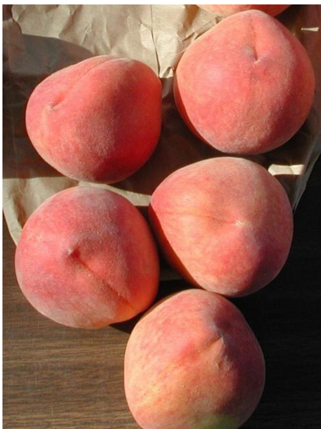
Figure 27. 'Flordaking'