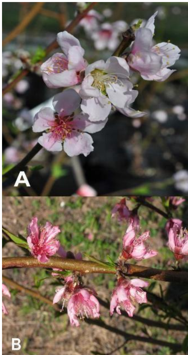
Figure 2. Showy (a) and non-showy (b) peach flowers.

Peach trees vary in their growth habit, and often a combination of tree vigor, flower type, and leaf structure can be used to identify cultivars. Trees can have semi-spreading (e.g., 'UFOne') or semi-upright growth (e.g., 'Flordaprince') and can be either very vigorous (e.g., 'UFSun') or moderately vigorous (e.g., 'Sunbest') in canopy growth. Flowers on certain peach cultivars can be showy , with large, pink petals; flowers on other cultivars are non-showy , with smaller, red-der petals (Figure 2). Leaf glands at the base of the leaf near the petiole can also be used in the identification process. Leaf glands may be absent ( eglandular ), or they may be globose (round) or reniform (kidney-shaped) (Figure 3).