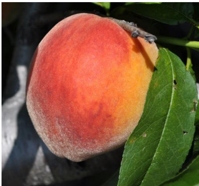
Figure 21. 'UF2000'