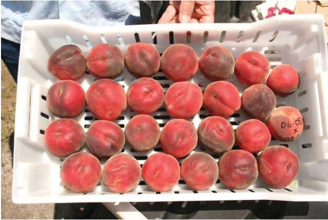
Figure 18. 'UFGem'

'UFGem' was released in 2013 and is a good candidate for the northern part of central Florida. It is a commercial cultivar with near 100% blush, average fruit size of 2.5-inch diameter, and symmetrical fruit shape. It is a clingstone peach with non-melting, yellow flesh, and firm texture. The average FDP is 83 days and sets fruit well when minimum nighttime temperatures are above 57°F (14°C) (Figure 18).