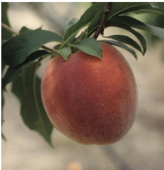
Figure 25. 'Flordacrest'

'Flordacrest' is a melting-flesh semi-clingstone peach cultivar released in 1988. 'Flordacrest' trees are vigorous with a spreading habit. 'Flordacrest' fruit has yellow flesh and develop 60–80% red blush over a bright yellow ground color. It is the best melting-flesh peach currently available for north Florida. It ripens after 'Flordaking' in north Florida, in early May in Gainesville, Florida with an FDP of 75 days (Figure 25).