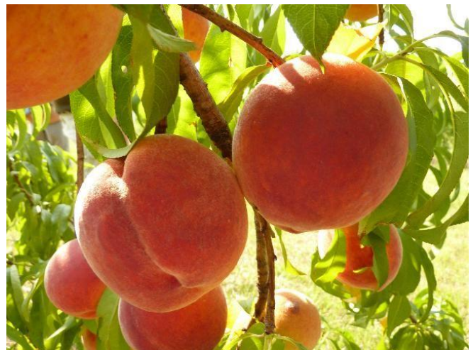
Figure 10. 'GulfAtlas'

'GulfAtlas' is a 2014 release from the UF, UGA, and the USDA ARS joint breeding program. It is a late season variety, with an FDP of 120 days. The fruit has non-melting flesh with a clingstone pit and bright yellow flesh. Fruit is very large and round and ripens about 3 weeks after 'Gulfcrimson'. Ripe fruit has a 75% blush, with some red pigmentation in the flesh under the skin. Trees are vigorous and semi-spreading with few blind nodes and good fruit set. 'GulfAtlas' is adapted to an area south of Attapulcus, GA, to Gainesville, FL (Figure 10).