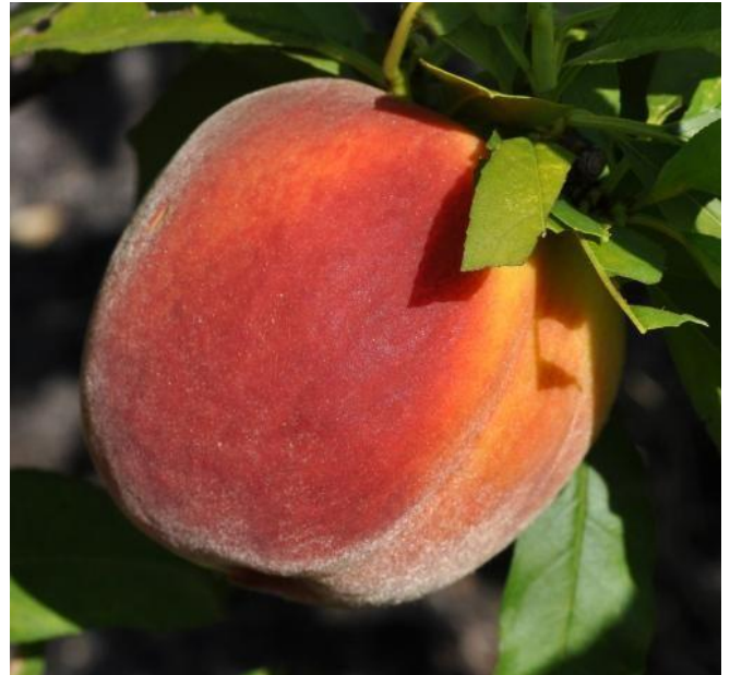
Figure 20. 'UFOne'

'UFOne' is a non-melting-flesh cultivar released by UF in 2008. 'UFOne' fruit is medium-large, and the trees regularly bear large crops of marketable fruit. 'UFOne' fruit is very firm with yellow flesh and semi-clingstone pits and develop 40% red blush over a yellow ground color. 'UFOne' fruit has a fairly long FDP of 95 days and ripen with 'UFBeauty' (early May) in Gainesville, Florida (Figure 20).