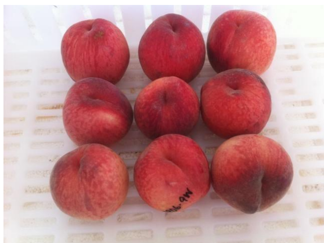
Figure 7. 'Gulfsnow'

'Gulfsnow' is a 2012 joint release from the University of Florida, University of Georgia, and USDA-ARS breeding program. Trees of 'Gulfsnow' are vigorous and semi-spreading, producing white, non-melting-flesh fruit. 'Gulfsnow' fruit is large, round, and attractive with a 50–60% blush over a cream background. The fruit is clingstone, with medium-sized, red pits and have an FDP of 110 days (Figure 7).