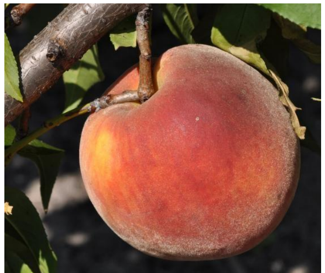
Figure 17. 'TropicBeauty'

'TropicBeauty' is a non-patented cultivar released jointly by the University of Florida and Texas A&M in 1989. The medium-sized, semi-freestone fruit have yellow, melting flesh and develop 70% blush over a yellow ground color. 'TropicBeauty' ripens between 'UFSun' and 'UFOne' and has an FDP of 89 days (Figure 17).