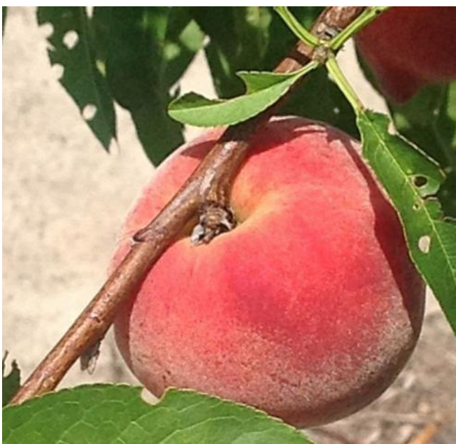
Figure 9. 'UFGlo'

'UFGlo' is a white-flesh, non-melting peach that was released in 2009. 'UFGlo' fruit are large, develop 80–90% blush over the entire fruit, and are clingstone. The FDP is 80–85 days. 'UFGlo' ripens in areas where the standard cultivar 'Flordaking' does well, and it complements 'UFSharp' peaches in north central Florida. It produces consistent crops with good yields in north Florida (Figure 9).