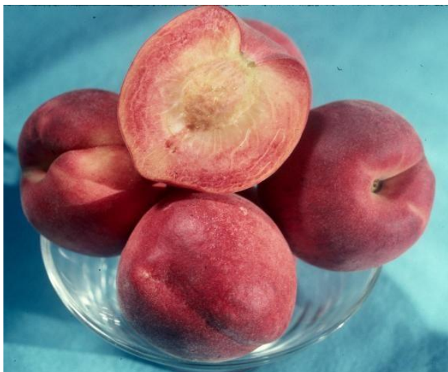
Figure 11. 'Gulfcrest'