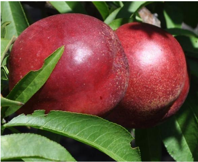
Figure 30. 'Sunmist'

'Sunmist' is a patented melting-flesh nectarine cultivar released in 1994. 'Sunmist' trees are highly vigorous and have a spreading growth habit. Fruit of 'Sunmist' have white flesh, are semi-freestone, and are large for an early ripening cultivar. Fruit develop nearly 100% red blush and are uniformly symmetrical. 'Sunmist' trees and fruit are highly resistant to bacterial spot. The FDP is 85 days, and the fruit ripens in early May in Gainesville, FL (Figure 30).