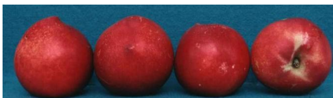
Figure 14. 'UFQueen'

'UFQueen' is a regular bearer of early, large fruit in north central Florida, with an FDP of 95 days. 'UFQueen' trees are semi-upright and are easily pruned to an open vase system. The fruit has non-melting flesh with clingstone pits and yellow flesh color. The fruit is slightly oval with a slight tip and develops 80–100% red skin over a yellow background. 'UFQueen' fruit ripens about 1 week after the standard 'Sunraycer' nectarine cultivar in mid-May in Gainesville, Florida (Figure 14).