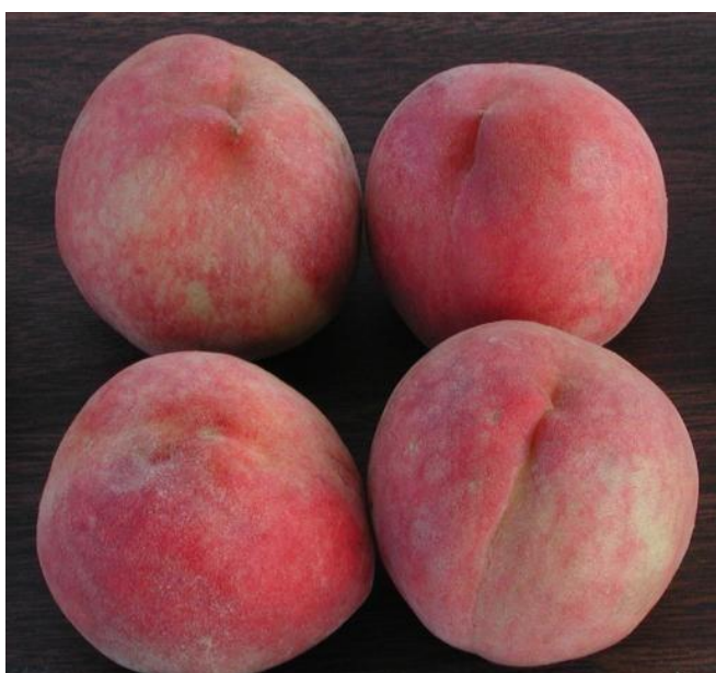
Figure 33. 'Flordaglo'

'Flordaglo' is a melting-flesh cultivar released by UF in 1988. The fruit develops 50–60% red blush with stripes, over a white ground color. 'Flordaglo' fruit are early ripening, semi-clingstone, and are bacterial spot resistant. Fruit ripens in early May, approximately 78 days after full bloom. 'Flordaglo' fruit is ideal for backyard or u-pick operations due to the melting flesh texture and its tendency to show bruises and abrasions easily (Figure 33).