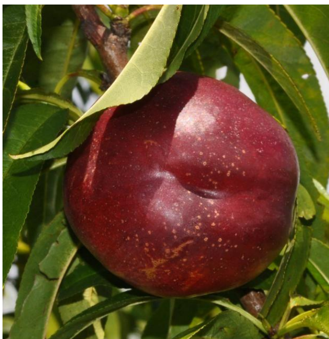
Figure 12. 'Sunbest'

'Sunbest', released in 2001, is a patented nectarine cultivar with yellow, melting flesh, and a semi-freestone pit. It develops 90–100% bright red blush over a yellow ground color, and has a FDP of 85–90 days. 'Sunbest' ripens in early May (Gainesville, FL), about 3 days before the standard 'Sunraycer' nectarine cultivar. It is superior to and a good replacement for 'Sunraycer' nectarine (Figure 12).