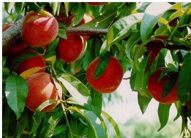
Figure 26. 'Gulfprince'

'Gulfprince' was jointly released by the University of Florida, University of Georgia, and USDA-ARS in 2002. Trees of 'Gulfprince' are large and vigorous with a spreading growth habit. 'Gulfprince' fruit are uniform and symmetrical and develop 45–55% solid red skin. Fruit have non-melting, yellow flesh with clingstone pits. 'Gulfprince' fruit has exhibited some slight browning due to oxidation on soft, ripe fruit. The FDP is 110 days (Figure 26).