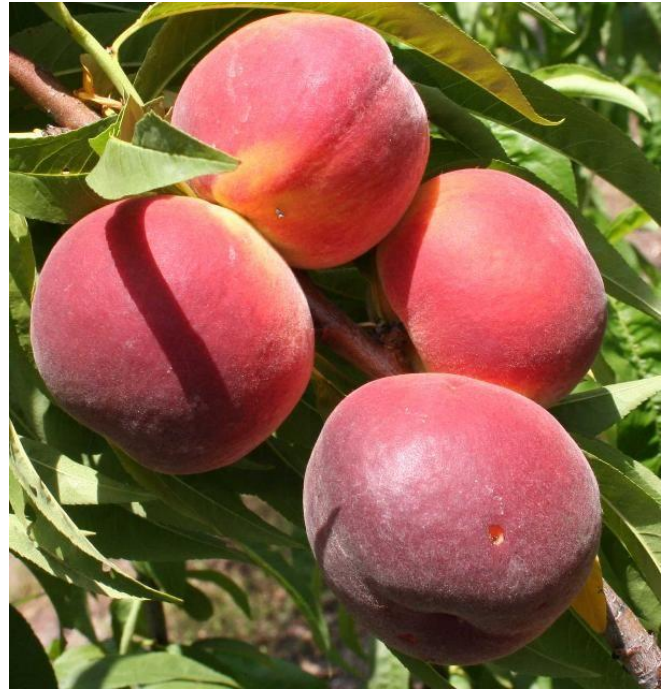
Figure 16. 'UFBest'

'UFBest' released by the UF breeding program in 2012, this non-melting-flesh cultivar produces heavy annual crops of large fruit. 'UFBest' fruit develop 95–100% red skin over a yellow ground color, and the flesh is yellow with clingstone pits. 'UFBest' ripens 1 week earlier than 'UFSun' (mid-April) in Gainesville, Florida, with an FDP of 85 days (Figure 16).