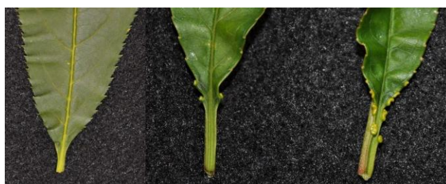
Figure 3. Eglandular (a), globose (b) and reniform (c) leaf glands on peach leaves.