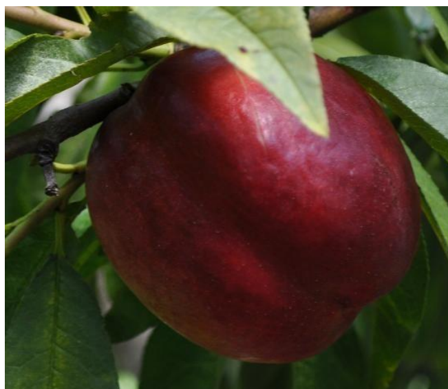
Figure 28. 'Sunraycer'

'Sunraycer' is a non-patented melting-flesh nectarine cultivar released in 1993. Trees are vigorous and semi-spreading, responding well to open-center pruning systems. 'Sunraycer' produces large, semi-clingstone fruit with good firmness resistance to bacterial spot. 'Sunraycer' fruit develop 80–100% brilliant red blush over a bright yellow ground color and are oval with no sharp tips or suture bulges. 'Sunraycer' has an 85-day FDP and ripens in early May in Gainesville, Florida (Figure 28).