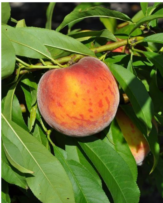
Figure 32. 'Flordaprince'