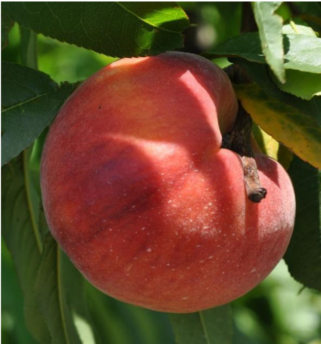
Figure 15. 'UFSun'

'UFSun' is a non-melting-flesh peach cultivar released in 2004 (Rouse et al. 2004). 'UFSun' trees bear heavy annual crops of early-season, medium-sized fruit, with yellow flesh and clingstone pits. 'UFSun' fruit are uniformly symmetrical and develop 50–60% red skin with darker red stripes. 'UFSun' fruit ripens with that of the standard peach cultivar 'Flordaprince' at Immokalee and Gainesville, Florida with an FDP of 80 days (Figure 15).