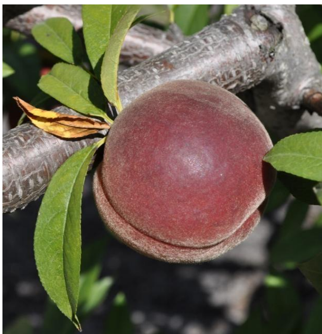
Figure 4. 'Flordabest'