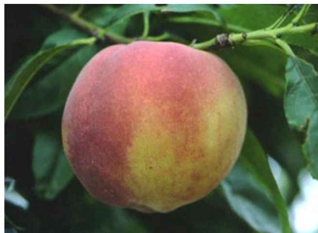
Figure 34. 'UFGold'

'UFGold' is a non-melting, yellow-flesh clingstone peach released by UF in 1996. 'UFGold' trees bear heavy annual crops of large fruit. Fruit are symmetrical in shape and develop 70–90% blush over an orange-yellow ground color. 'UFGold' fruit ripen approximately 80 days after bloom, in early May (Gainesville, FL) (Figure 34).