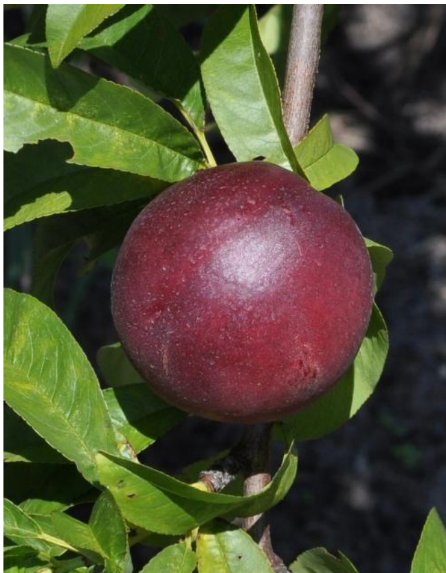
Figure 13. 'UFRoyal'

'UFRoyal' is a yellow flesh, non-melting nectarine, with an FDP of 85 days. 'UFRoyal' fruit is large, with 100% red skin, and a semi-clingstone pit. Fruit are symmetrically oval and ripen approximately 1 week before 'UFQueen' (below) in early May (Gainesville, FL). 'UFRoyal' fruit have excellent firmness and flavor, with excellent shipping potential (Figure 13).