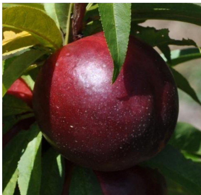
Figure 29. 'Sunbest'

'Sunbest' is a patented melting-flesh nectarine cultivar released in 2001. 'Sunbest' trees are semi-upright and vigorous, responding well to open-center pruning systems. 'Sunbest' fruit develop 90–100% bright red blush over a yellow ground color, are semi-freestone, and resist bacterial spot well. 'Sunbest' is intended as a replacement for 'Sunraycer' nectarine because of its larger and more attractive fruit. 'Sunbest' has an FDP of 85–90 days, and fruit ripens approximately 3 days before 'Sunraycer' nectarine and 'Flordaglo' peach in Gainesville, FL (Figure 29).