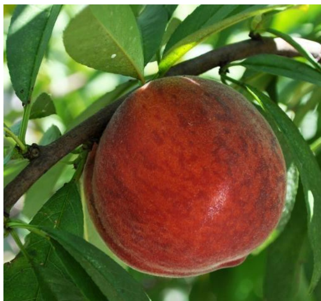
Figure 6. 'Gulfking'

days, and the fruit develops good size, shape, and color in north Florida (Figure 6).