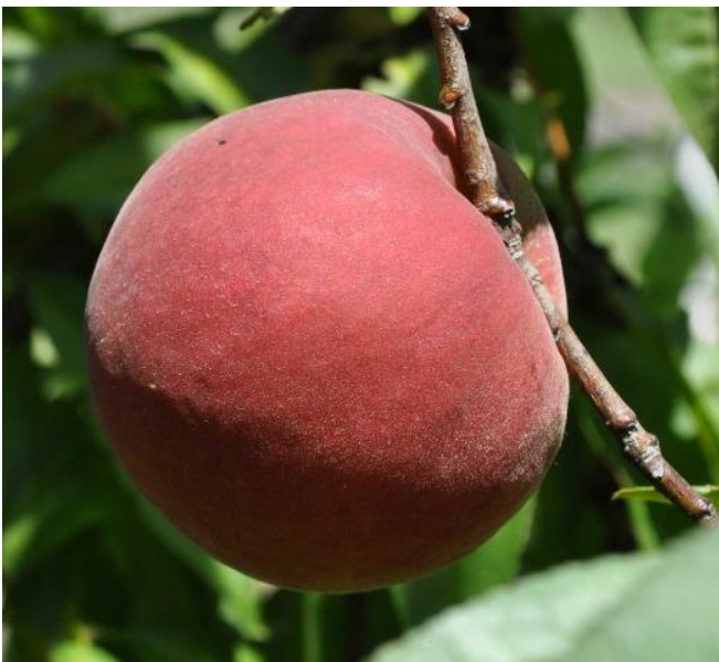
Figure 19. 'UFBeauty'

'UFBeauty' is a peach cultivar released in 2002 with fruit that has non-melting-flesh, clingstone pits, and very symmetrical shape. The flesh of 'UFBeauty' fruit is yellow and very firm, and the skin color is near 100% red, with darker red stripes. 'UFBeauty' ripens 3 to 4 days after 'UFGold' in Gainesville, Florida, with an FDP of 82 days. Cropping of 'UFBeauty' has been unreliable in south Florida when night temperatures during the bloom period are higher than 57°F (14°C) (Figure 19).