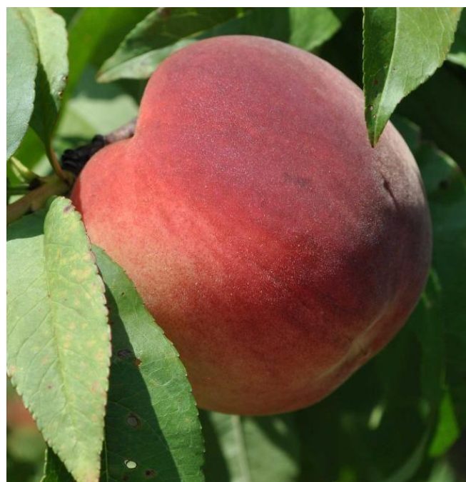
Figure 35. 'TropicSnow'

'TropicSnow' was jointly released by UF and Texas A&M in 1989. Its fruit has white, melting-flesh, semi-freestone pits. 'TropicSnow' fruit develop 40–50% red blush over a creamy white background and have very low acid combined with excellent sweetness. 'TropicSnow' has an FDP of 90–97 days (Figure 35).