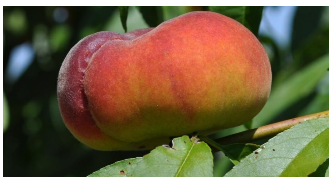
Figure 5. 'UFO'

'UFO' is a non-melting-flesh, peentotype peach with a unique donut shape. It was patented in 2002 and produces large, vigorous trees with a semi-upright growth habit. UFO' produces moderately heavy crop loads of large, firm fruit with yellow flesh and semi-freestone pits that have an FDP of 95 days. The skin develops 50–70% blush. This cultivar is particularly susceptible to ethylene that is released during dormant pruning, which can result in significant flower bud abortion. Thus, pruning is only recommended during the summer period (Figure 5).