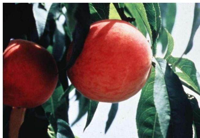
Figure 23. 'Flordadawn'

'Flordadawn' is a melting-flesh non-patented peach cultivar released in 1989. 'Flordadawn' trees are vigorous and produce large numbers of flowers with moderately high fruit set. The bloom period of 'Flordadawn' is extended, which can help with fruit set during early spring frosts. The FDP of 'Flordadawn' is 60 days, which is the shortest of any named peach variety. Fruit of 'Flordadawn' develop 80% red blush and have yellow flesh with a semi-clingstone pit. However, light crop loads have resulted in as much as 50% split pit incidence. 'Flordadawn' can often be found in large stores and nurseries for backyard plantings (Figure 23).