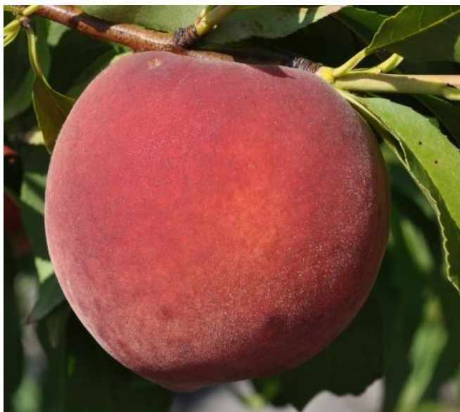
Figure 24. 'UFSharp'