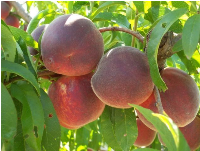
Figure 8. 'Gulfcrimson'

ripening cultivar and have a yellow ground color with 80–90% red skin. 'Gulfcrimson' ripens with the standard peach cultivar 'JuneGold' in Attapulcus, Georgia, with an FDP of 95 days and highly consistent cropping, making it a good mid-season replacement for 'JuneGold'. It also crops reliably in north Florida (Figure 8).