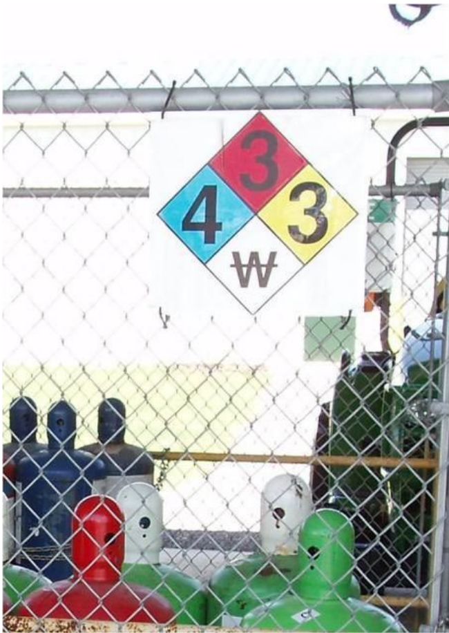
Figure 3. National Fire Protection Association warning at a fumigant storage site. The strikeover on the letter "W" in the white diamond alerts firefighters not to use water to put out a fire.

A hazardous rating system used to assist emergency response personnel is the National Fire Protection Association (NFPA) Hazard Identification System. This system uses a diamond-shaped warning symbol. The top, left, and right boxes refer to flammability, health, and instability hazards, respectively, and each contains a number from 0 to 4 (Table 1). The bottom box is a warning against the use of water. Some pesticides and their storage sites will be marked with such a warning to alert firefighters not to use water to put out a fire (Figure 3).