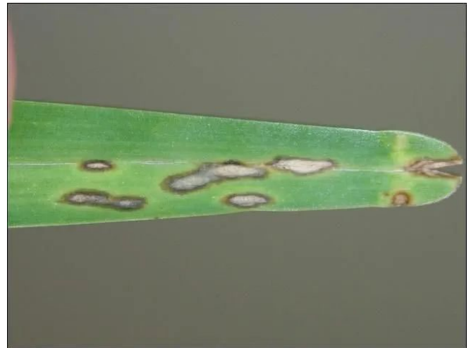
Figure 1. Leaf spot symptoms of gray leaf spot are shown on a St. Augustinegrass leaf blade. The gray coloration in the center of the lesions is a flush of spores produced after incubation at 100% relative humidity for 24 hours. Rapidly expanding lesions will sometimes have an olive green water-soaked border.

The most diagnostic disease symptom is an oblong leaf spot. The center of the leaf spot may have a gray felt-like growth of sporulation (formation of spores) after extended periods of warm moist conditions (Figure 1). A leaf spot may appear olive green to brown with a dark brown border when sporulation is not present (Figure 2). When the disease is severe, stands may appear thin and generally unthrifty (Figure 3). Closer inspection will reveal several leaf spots, many of which may have coalesced to turn entire blades or shoots brown. The disease generally reduces vigor of the turf and can slow grow-in of sprigged areas and the recovery of damaged St. Augustinegrass (Figure 4).