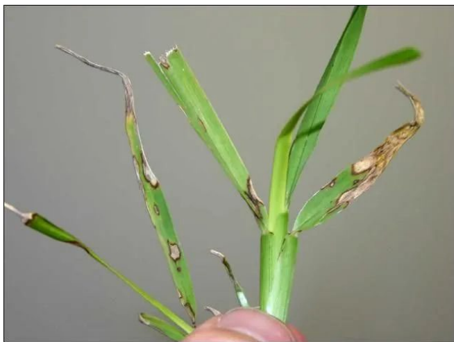
Figure 2. Gray leaf spot caused by Pyricularia grisea on a shoot of St. Augustinegrass. Lesion centers are straw-colored and surrounded by a dark necrotic border. Lesions may appear on the leaf blades, leaf sheaths, and stolons.