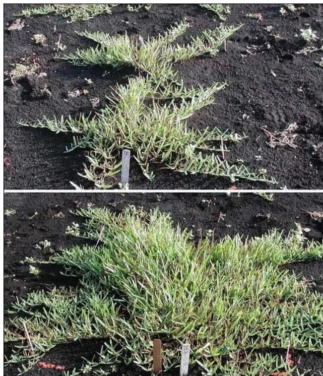
Figure 4. Gray leaf spot can substantially reduce vigor and can prolong the grow-in phase of St.

Augustinegrass sprigged for sod production. Both sprigs in the figure were planted at the same time, but only the plot on the bottom was treated with a Qol fungicide product to prevent gray leaf spot.