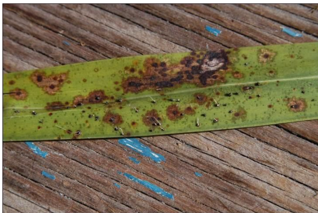
Figure 4. Mixed infection of Graphiola phoenicis and Stigmata palmivora (large brown spots). Note that some Stigmata leaf spots have a sorus of Graphiola phoenicis within the leaf spot.