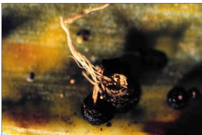
Figure 2. Close-up of sori of Graphiola phoenicis with filaments protruding.

The sorus (sori is the plural form) is a black fruiting body that is less than 1/16 inch in diameter (Figure 2). As the sorus matures and yellow spores are produced, short, light-colored filaments (thread-like structures) will emerge from the black body (Figure 2). These filaments aid in spore dispersal. Once the spores are dispersed, the sori deflate and appear like a black, cup-shaped body or black crater. You can easily see the sori, but you can also feel the sori with your finger as they are raised above the leaf epidermis. The number of sori indicates the level of infection (Figure 3).