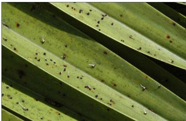
Figure 1. The small black bodies are sori (fruiting bodies) of Graphiola phoenicis that have erupted through the leaflet epidermis. The black spots are symptoms of potassium deficiency, and not Graphiola leaf spot.