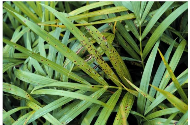
Figure 2. Leaf spots on palm leaflets. These are brown with a chlorotic (yellow) halo. Note that as spots increase in number and size that there is a merging of dead tissue (blight).