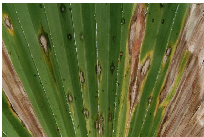
Figure 1. Multiple stages of leaf spots on palm leaf blade – small lesions surrounded by water soaking to large areas of blighted, necrotic tissue.

If environmental conditions are optimum for the disease, the spots can increase in number or size such that large portions of a fan palm blade or large number of leaflets of a feather palm blade are diseased. If severe enough, entire leaflets or leaves may desiccate and die as lesions expand and coalesce, causing leaf blights.