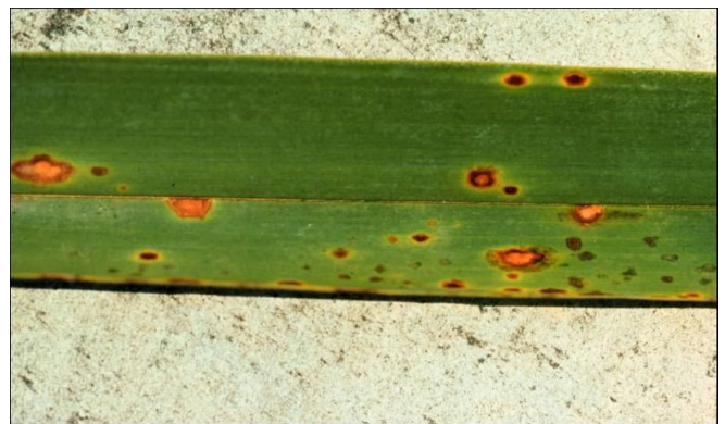
Figure 3. Leaf spots often change in color and size as the disease progresses.