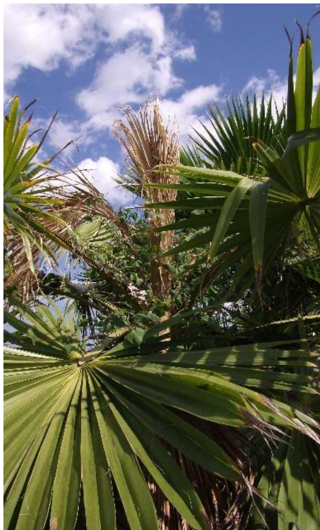
Figure 2. Washingtonia robusta exhibiting typical bud rot symptoms. Only the spear leaf and next youngest leaf are affected by the pathogen; older leaves remain healthy.