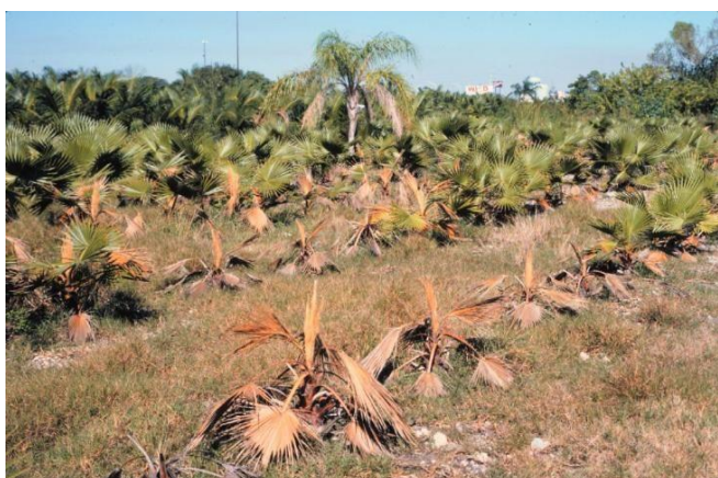
Figure 4. Multiple Washingtonia robusta in this field nursery are being affected by Phytophthora bud rot. Those most affected were juvenile palms in a low-lying area.

In the landscape, bud rot caused by Phytophthora is more likely to occur during the rainy season and appears to occur with greater frequency after a tropical storm or hurricane (Figure 4). In container nurseries or field production of juvenile palms, however, bud rots can occur at any time, especially if the palms are watered via overhead irrigation.