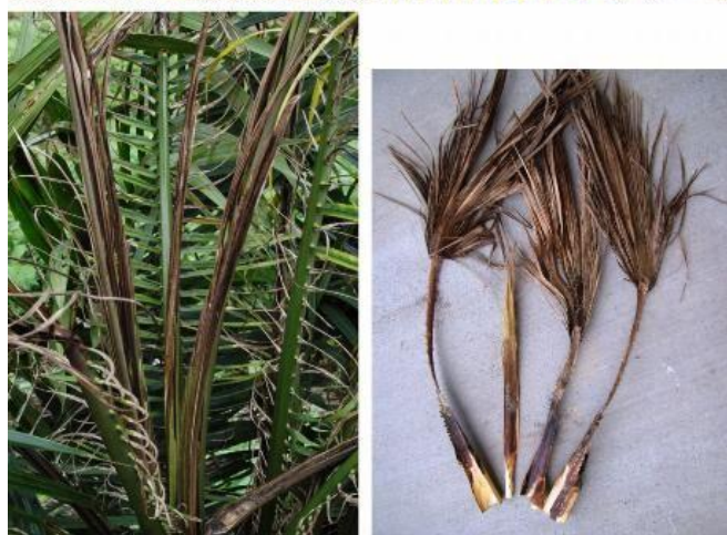
Figure 1. Spear leaf and next youngest leaf exhibiting typical symptoms of Phytophthora bud rot.