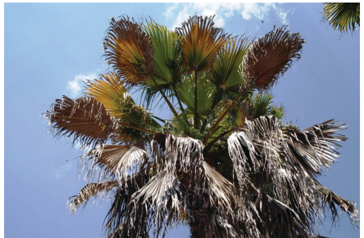
Figure 7. Mexican fan palm exhibiting typical symptoms of Fusarium wilt. Over half of the leaves have died, all in the lowest part of the canopy. The dying leaves have reddish brown stripes on the petiole.