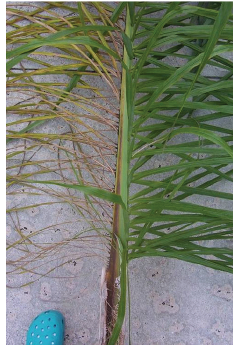
Figure 1. Beginning leaf symptoms of Fusarium wilt: The lowest leaflets on the left side of this queen palm leaf are beginning to die, and there is a reddish brown stripe moving from the petiole into the rachis.

months after initial symptom development. Due to the quick decline, a very characteristic symptom of this disease is the overall canopy appearance. The necrotic leaves do not droop or break and bend down around the trunk, but remain relatively rigid (Figures 5, 6, and 7).