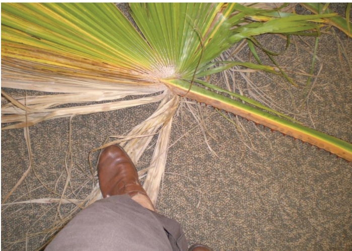
Figure 4. This Mexican fan palm leaf blade has half green and half dead or dying leaf segments. Note the reddish brown stripe on the petiole; it is on the same side as the dying leaf segments in the blade.