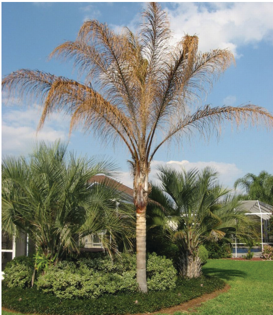
Figure 5. Queen palm exhibiting typical late-stage symptoms of Fusarium wilt. The entire canopy is necrotic, but leaves are not drooping or hanging down around the trunk.