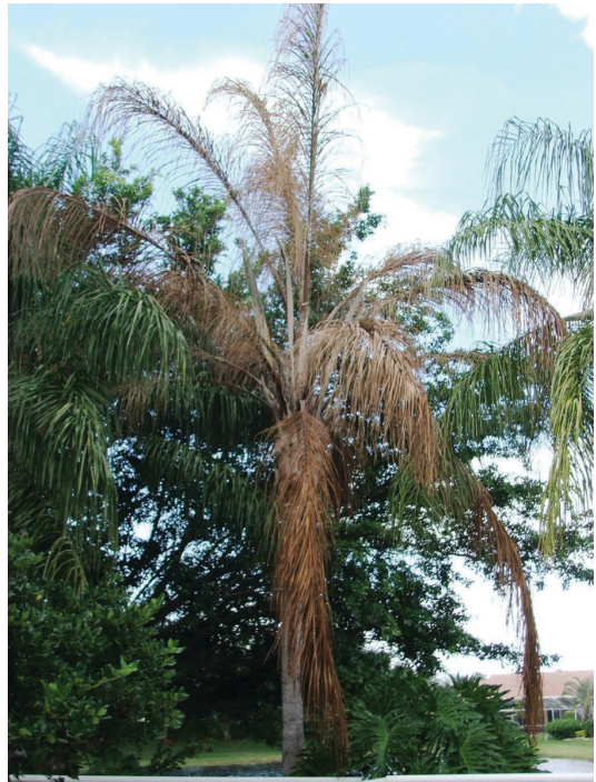
Figure 6. Queen palm exhibiting typical late-stage symptoms of Fusarium wilt. The entire canopy is necrotic, but only a few leaves are hanging down around the trunk.