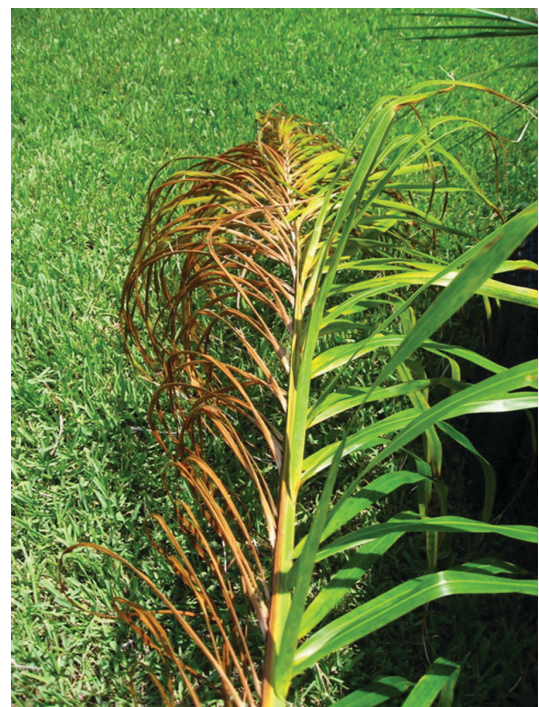
Figure 2. Over half of the leaflets on this queen palm leaf have died or are dying, and there is a reddish brown stripe along the entire left side.