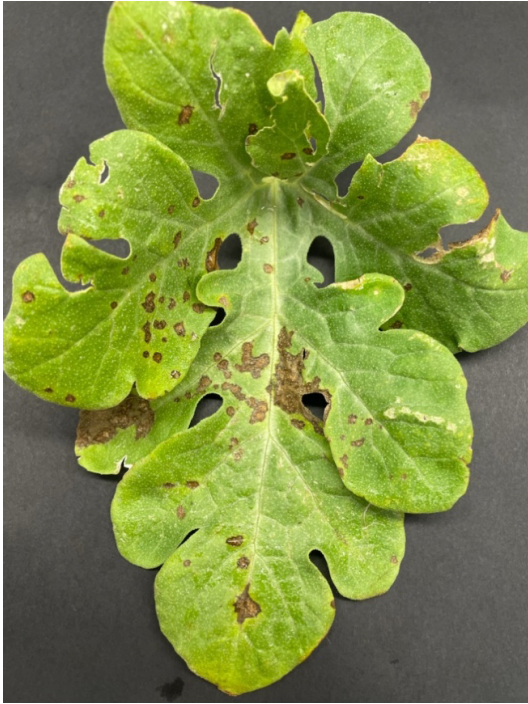
Figure 1. Anthracnose lesions on watermelon leaves appear roughly circular and coalesce to form larger lesions.