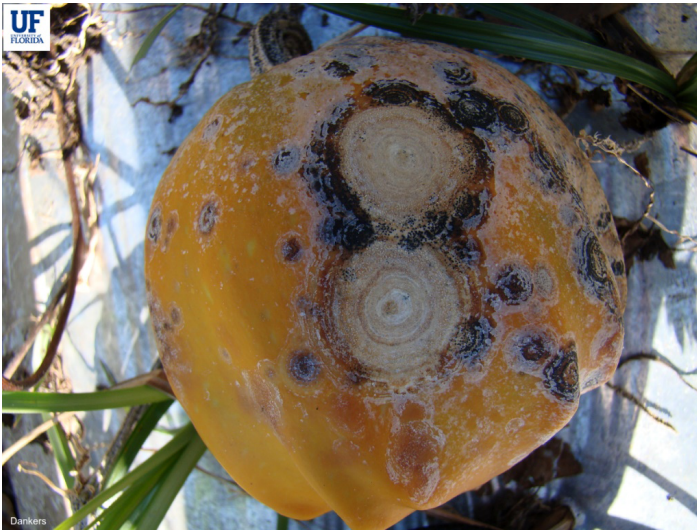
Figure 6. A pumpkin fruit exhibiting lesions of anthracnose containing masses of salmon-colored conidia.