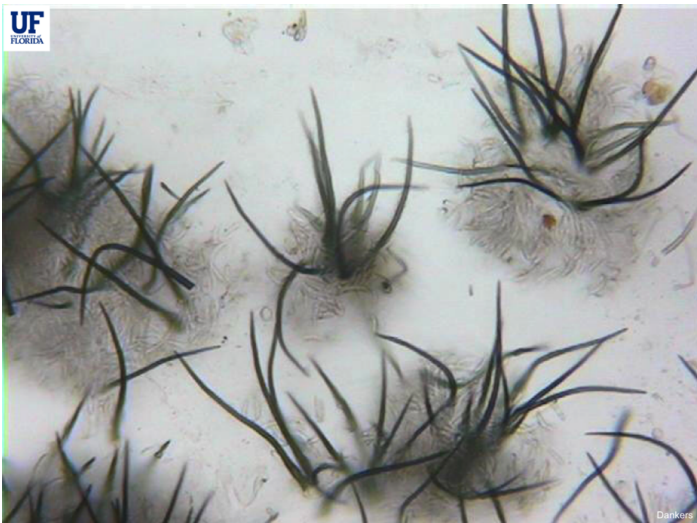
Figure 7. Hair-like structures (setae) and conidia (spores) of the fungus.