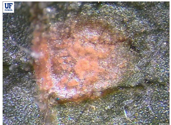
Figure 9. Lesion containing exudate of salmon-colored spores are characteristic signs of the pathogen.