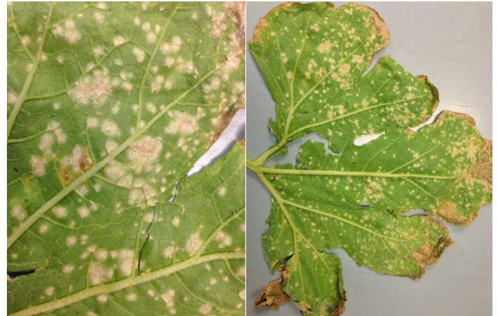
Figure 4. Anthracnose lesions on a squash leaf.

Identification of the fruiting bodies and spores is diagnostic for this disease. Dark acervuli (fruiting bodies) and a profusion of single-celled spores (conidia) are visible with a microscope (Figures 7 and 8). Additionally, the salmon-colored lesions are indicative of anthracnose (Figure 9).