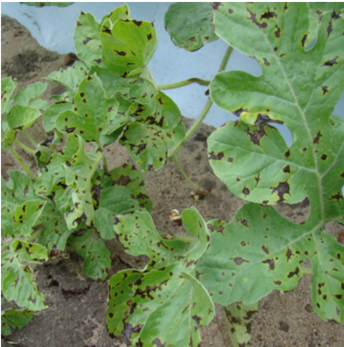
Figure 2. Anthracnose lesions on watermelon leaves appear roughly circular to angular.