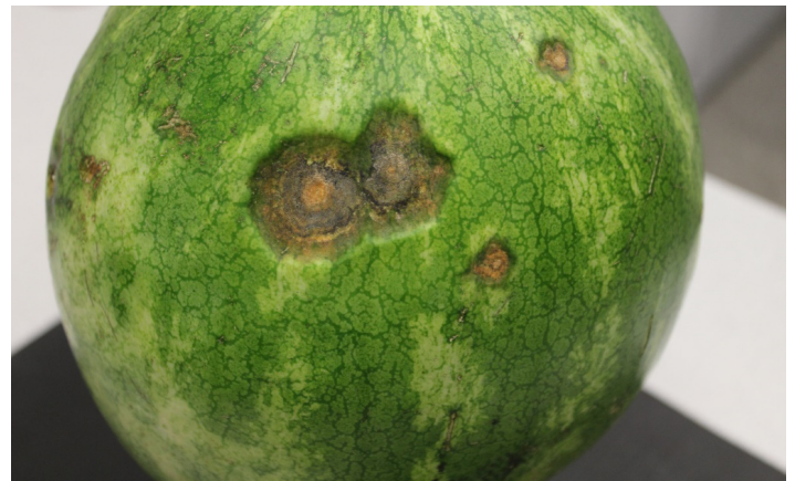
Figure 5. Watermelon fruit exhibiting lesions of anthracnose containing masses of salmon-colored conidia.

Identification of the fruiting bodies and spores is diagnostic for this disease. Dark acervuli (fruiting bodies) and a profusion of single-celled spores (conidia) are visible with a microscope (Figures 7 and 8). Additionally, the salmon-colored lesions are indicative of anthracnose (Figure 9).