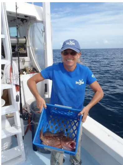
Figure 6. A weighted milk crate placed upside down in the water is one tool used for weighted descent.