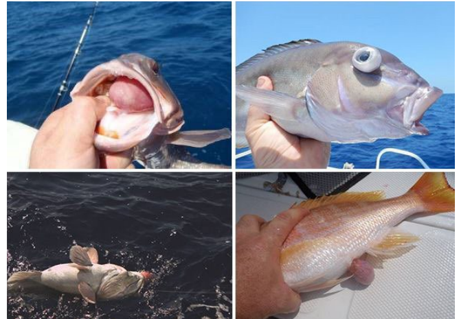
Figure 1. Signs of barotrauma include everted or protruding stomach coming out of the mouth (top left); bulging eyes (top right); bloated belly (bottom left); distended intestines (bottom right).

Physical signs of barotrauma include protrusion of the stomach from the fish's mouth, bulging eyes, bloated belly, bubbling scales, and distended intestines.