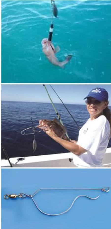
Figure 7. Common weighted descent tools include pressurized-release tools (top); weighted spring-release tools (middle); and S-shaped wire hook clips (bottom).

Common weighted descent concerns among anglers include: