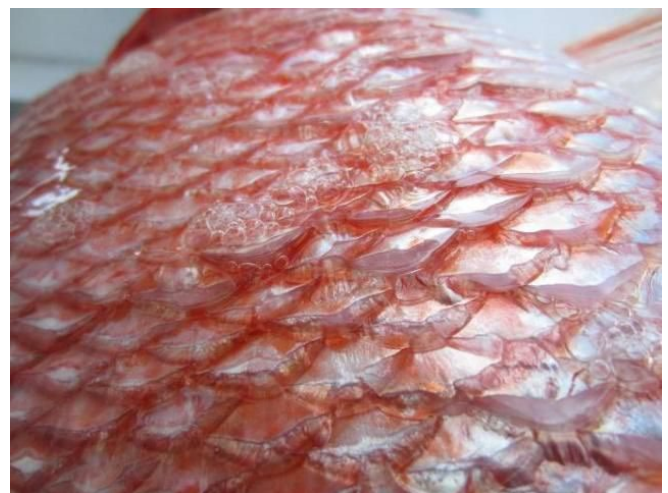
Figure 2. Signs of barotrauma also include bubbling scales, and inability to return to depth.