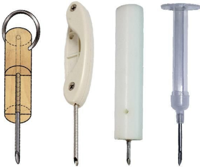
Figure 5. Common venting tools. (Pictured images do not imply commercial endorsement.)