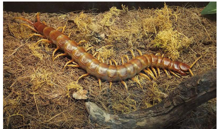
Figure 3. Soil arthropod.

Microarthropods are animals with an exoskeleton (a hard, external covering of the body), a segmented body, and jointed appendages. Examples that can be found in the soil include mites, springtails, and acari. They can be either herbivores or predators, and in addition to preying on other microorganisms, they shred organic matter, which helps stimulate microbial activity.