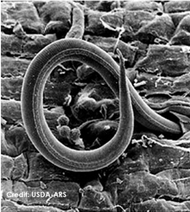
Figure 4. Soil nematode.

Nematodes are microscopic, non-segmented worms. The typical gardener will often associate the term nematodes with the root-feeding nematodes such as root-knot nematodes. In addition to these nematodes, which are commonly thought of as pests, there are fungal- and bacterial-feeding nematodes as well as predatory nematodes. They cycle nutrients and are a food source for other microbes, and some of them consume bacteria and pathogenic fungi, which can suppress disease.