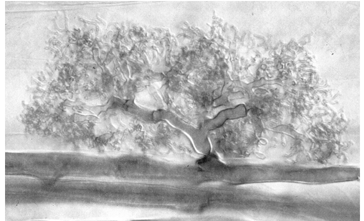
Figure 1. Soil fungi.

responsible for most of the cycling of nitrogen, carbon, and sulfur within soils.