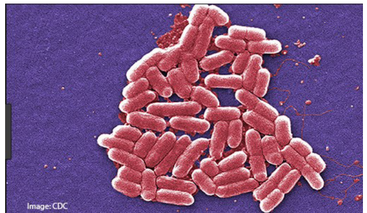
Figure 2. Soil bacteria.

Microarthropods are animals with an exoskeleton (a hard, external covering of the body), a segmented body, and jointed appendages. Examples that can be found in the soil include mites, springtails, and acari. They can be either herbivores or predators, and in addition to preying on other microorganisms, they shred organic matter, which helps stimulate microbial activity.