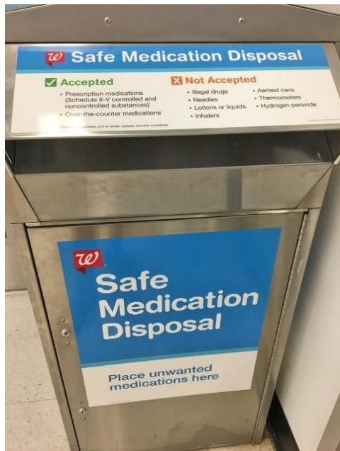
Figure 3. Anonymous medication disposal drop-off box offered by a pharmacy in Gainesville, FL.

locations. Finally, pharmacies may provide drop-off locations within their stores (Figure 3). In order to identify the best location or event to bring your unwanted medications for disposal, you may contact your local trash and recycling service, your sheriff's office or police department, or your nearby pharmacy. In lieu of contacting these organizations, a list of year-round controlled substance public disposal locations can be found at https://apps.deadiversion.usdoj.gov/pubdispsearch/spring/main?execution=e1s1 .