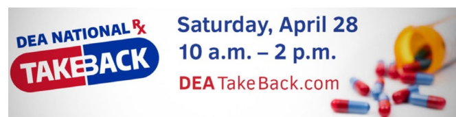
Figure 2. Example of an advertisement for the DEA National Drug Take Back Day.

The best way to dispose of unwanted medications is to bring them to an expert that knows how to properly dispose of them. The United States Drug Enforcement Administration (DEA) regularly sponsors National Prescription Take Back Days, typically occurring biannually in April and October (Figure 2).