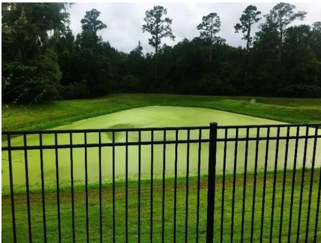
Figure 1. An urban stormwater pond in Gainesville, FL.

The majority of the global population currently resides in cities, and this is especially true in Florida. According to the 2010 US Census, more than 90% of Florida residents live in suburban or urban areas. Our increasingly urban world has led to an increased awareness of the importance of urban ecological processes and their potential impacts on natural resources. Urbanization has a particularly large effect on the nitrogen (N) cycle, reducing watershed N retention and increasing downstream N export. Excess N export can lead to eutrophication, with associated algal blooms, and periodic hypoxia in freshwater and coastal ecosystems. These effects are particularly evident in the state of Florida. In fact, through controls on N loading the City of Tampa was able to improve water quality, with subsequent improvements in water clarity and seagrass recovery (Greening et al. 2011). With 80% of Florida's residents living within 10 miles of the coast, Florida's aquatic resources are directly affected by urbanization. For more information on eutrophication and the role of N, see EDIS publication