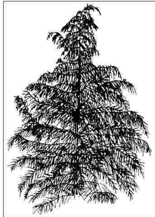
Figure 1. Young Juniperus virginiana ‘Pendula’: ‘Pendula’ Eastern redcedar.