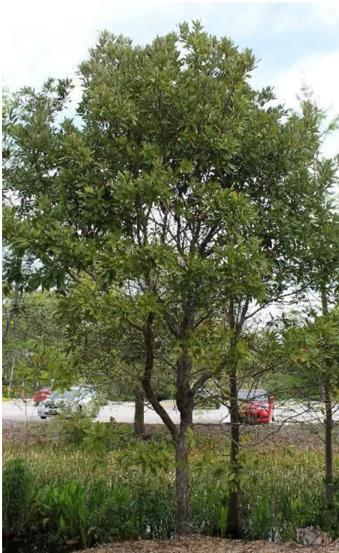
Figure 1. Full form— Persea borbonia : redbay.

This handsome North American native evergreen tree can reach 50 feet in height with a comparable spread but is often seen somewhat shorter and wider, particularly when grown in the open in an urban area. The glossy, leathery, medium to dark green, six-inch leaves emit a spicy fragrance when crushed and the inconspicuous, springtime flower clusters are followed by small, dark blue fruits which ripen in fall. These fruits are enjoyed by birds and squirrels and add to the tree's overall attractiveness. The trunk bears very showy, ridged, red-brown bark and frequently branches low to the ground forming a multi-stemmed habit similar to live oak, but it can be pruned to make a single, short central leader which would be most suitable for many urban plantings.