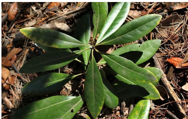
Figure 3. Leaf— Persea borbonia : redbay.