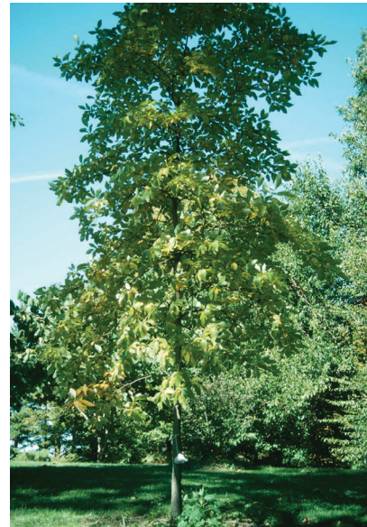
Figure 1. Middle-aged Sassafras albidum : sassafras

Availability: somewhat available, may have to go out of the region to find the tree