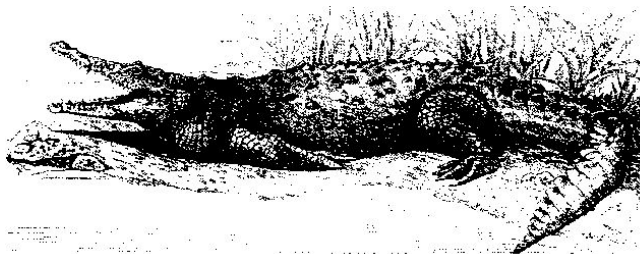
Figure 1. American crocodile.

If extinction is a natural process, why should we make an effort to save endangered species? Because we can no longer attribute the accelerating extinction of plants and animals to natural causes. Today most species of plants and animals become extinct because of habitat destruction (loss of living space to development or pollution), introduction of non-native organisms, and direct killing (over-harvesting, poisoning). Florida's endangered wildlife includes the American crocodile (Figure 1), loggerhead sea turtle (Figure 2), the West Indian manatee (Figure 3).