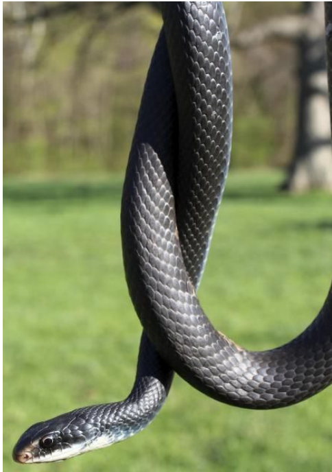
Figure 16. Southern Black Racer Coluber constrictor priapus