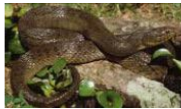
Figure 4. Florida Green Water Snake Nerodia floridana

A nonvenomous species, the Florida green water snake may bite if cornered. It is commonly found near semi aquatic areas and open wetlands with vegetation and marshes. Its diet consists of mainly frogs and fish. This water snake is generally dark olive green or brownish in color.