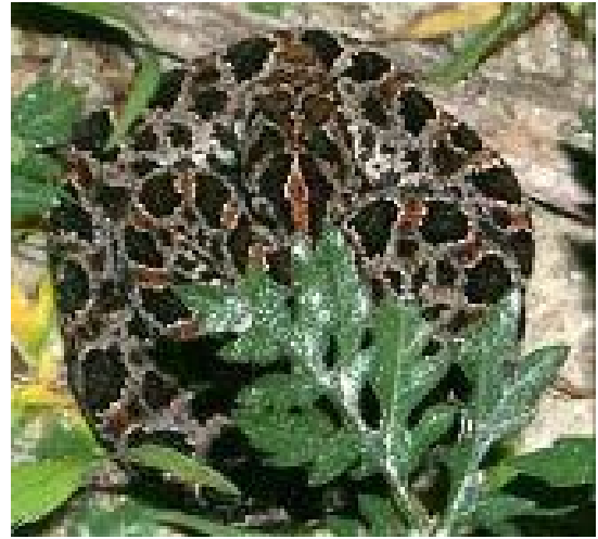
Figure 32. Dusky Pigmy Rattlesnake Sistrurus miliarius barbouri