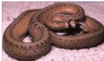
Figure 9. Florida Brown Snake Storeria dekayi victa

The Florida brown snake is nonvenomous and does not bite. A common snake, it can be found in moist areas, and along water, often hiding among water hyacinths. Its diet consists of slugs, earthworms, and insects. This species is generally speckled brown to blue-gray (can be highly variable), with a pale band behind the head and a brown spot below the eye.