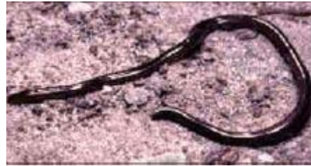
Figure 3. Brahminy Blind Snake Ramphotyphlops braminus

The Brahminy blind snake is an introduced species to southern Florida. It is nonvenomous and does not bite. Commonly found in flower beds and gardens, it eats ant and termite eggs, larvae, and pupae. This species is slender, wormlike, and shiny black with very small eyes and jaw. It is a unisexual species, consisting of only females.