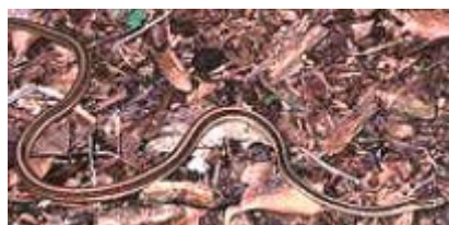
Figure 11. Peninsula Ribbon Snake Thamnophis sauritus sackenii

The peninsula ribbon snake is nonvenomous and does not bite. Commonly found in uplands, usually near water, this species prefers small prey taken from or near water, such as frogs, tadpoles, lizards, and earthworms. It has a slender body and tail, usually brownish in color with a pale stripe down the back and on each side.