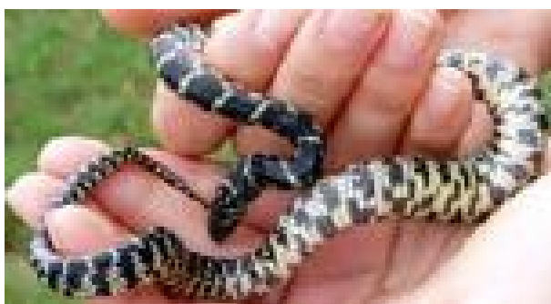
Figure 27. Juvenile Florida Kingsnake Lampropeltis getula floridana