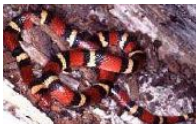
Figure 28. Scarlet Kingsnake Lampropeltis triangulum elapsoides

This uncommon species is nonvenomous and does not bite. The scarlet kingsnake is found in most habitats, primarily pine flatwoods, wet prairie hammocks, and sugarcane fields. It preys on smaller snakes, skinks, and other small animals. The Scarlet Kingsnake has wide red, and narrow yellow and black bands, and a red snout. The red and yellow bands never touch. Note: Compare to the eastern coral snake and Florida scarlet snake.