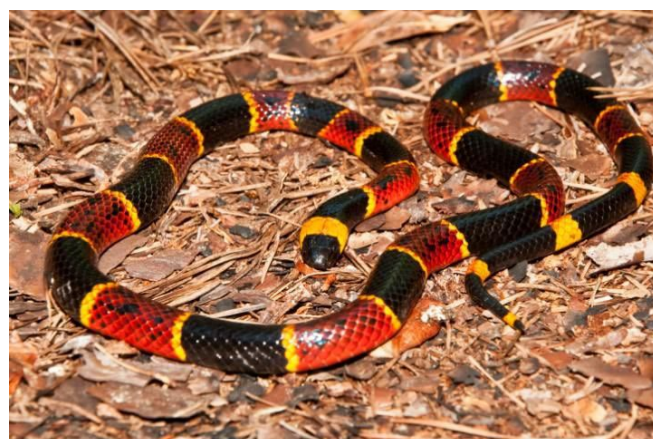
Figure 30. Eastern Coral Snake Micrurus fulvius fulvius

This snake is venomous and may bite if threatened. The eastern coral snake prefers wooded habitat, usually upland. Its diet consists of small snakes, but it will also eat other small animals. It has broad red and black bands separated by narrow yellow bands. The snout is black. Red bands touch yellow bands in this snake only.