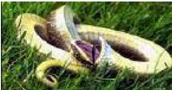
Figure 13. Eastern Hognose Snake Heterodon platirhinos . Death-feigning act.