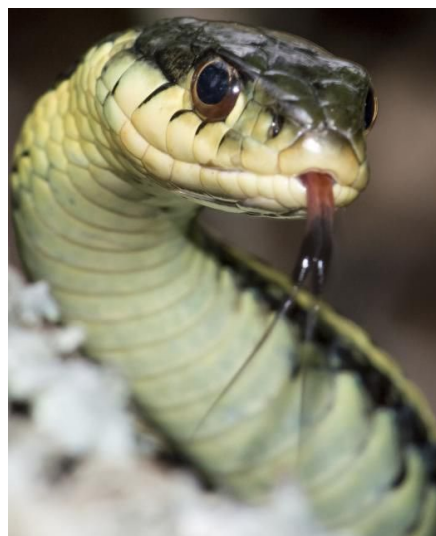
Figure 10. Eastern Garter Snake Thamnophis sirtalis sirtalis

The eastern garter snake is nonvenomous and rarely bites. A common snake, its habitat includes lowland and wet areas. Its diet consists of aquatic or semiaquatic animals including fish, frogs, salamanders, and snakes. It is generally turquoise or blue green with a stripe along its back and another on each side.