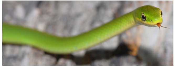
Figure 19. Rough Green Snake Opheodrys aestivus

The rough green snake is nonvenomous and does not bite. It is commonly found in trees and shrubs on the edges of fields, roads, and ponds. Its diet consists of insects and spiders. The rough green snake is green overall, while its lips, chin and belly are a pale yellow color.