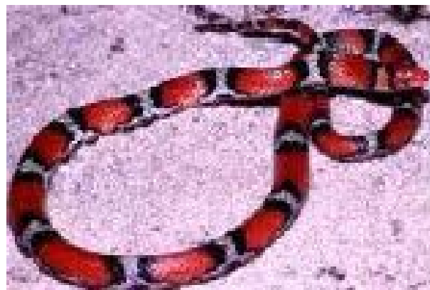
Figure 29. Florida Scarlet Snake Cemophora coccinea coccinea

This snake is nonvenomous. The Florida scarlet snake prefers habitat with soil suitable for burrowing. It can also be found in logs or beneath bark. Its diet consists of young mice, small snakes, and lizards, but it will also eat snake eggs. This snake has wide red, and narrow yellow and black bands that do not encircle the body. Its snout is red and pointed. Note: Compare to the eastern coral snake and scarlet kingsnake.