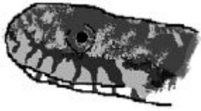
Figure 1. Water Snake: Non-venomous; round eyes; striped or dark upper lip