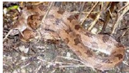
Figure 5. Brown Water Snake Nerodia taxispilota

A nonvenomous species, the brown water snake may bite if cornered. Commonly found near wooded aquatic areas, swamps, cypress domes, and other quiet waters, it is largely diurnal. Brown water snakes eat frogs and fish but will also eat carrion such as scavenged fish. This snake has large brown colored blotches that are not connected over its back.