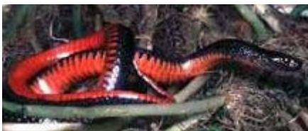
Figure 8. South Florida Swamp Snake Seminatrix pygaea cyclas

The South Florida swamp snake is timid and does not bite. It is commonly found in freshwater ponds and ditches, especially those with an abundance of water hyacinths. It feeds mainly on frogs, tadpoles, small salamanders, and invertebrates. Swamp snakes ( Seminatrix pygaea ) are shiny black with a red belly and have smooth scales. The South Florida swamp snake is distinguished from other swamp snake subspecies by the presence of a short, triangular black mark at the front edge of each ventral scale.