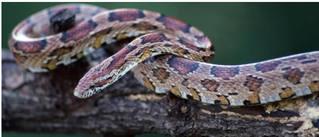
Figure 23. Corn Snake Elaphe guttata guttata