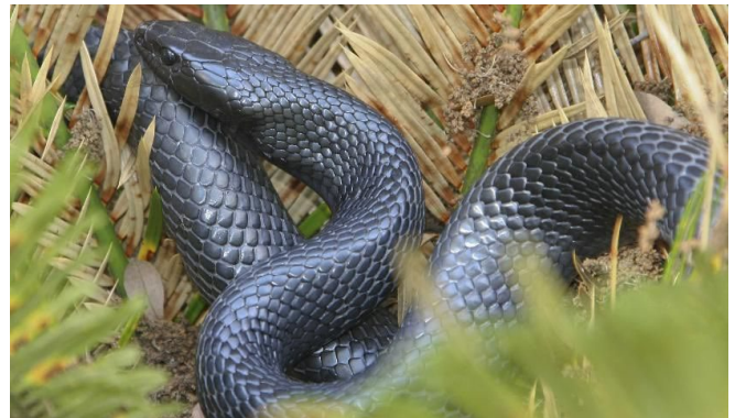
Figure 20. Eastern Indigo Snake Drymarchon corais couperi

This rare species is nonvenomous, and bites infrequently. The eastern indigo snake is a federally protected, threatened species. Preferring upland areas and riparian corridors, its diet consists of small mammals, birds, frogs, and snakes. The eastern indigo snake is Florida's largest nonvenomous snake and has glossy blue/black scales and a reddish chin and throat.