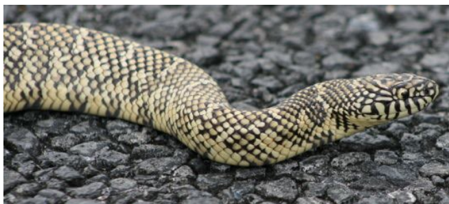
Figure 26. Florida Kingsnake Lampropeltis getula floridana