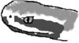
Figure 2. Cottonmouth: Venomous; vertically slit eyes with stripe through eye; light upper lip