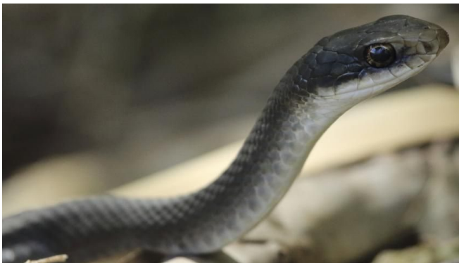
Figure 17. Everglades Racer Coluber c. paludicola