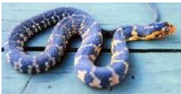
Figure 7. Juvenile Florida Water Snake Nerodia fasciata pictiventris