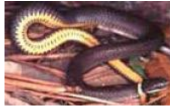
Figure 14. Southern Ringneck Snake Diadophis punctatus punctatus

This small, common snake is nonvenomous and does not bite. The southern ringneck snake is generally found in damp meadows, woodlands, and residential areas. Its diet consists of earthworms, slugs, and small vertebrates. It is gray black with a yellow or orange ring behind the head and a yellow belly, changing to red posteriorly and under its tail.