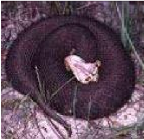
Figure 31. Florida Cottonmouth Agkistrodon piscivorus conanti