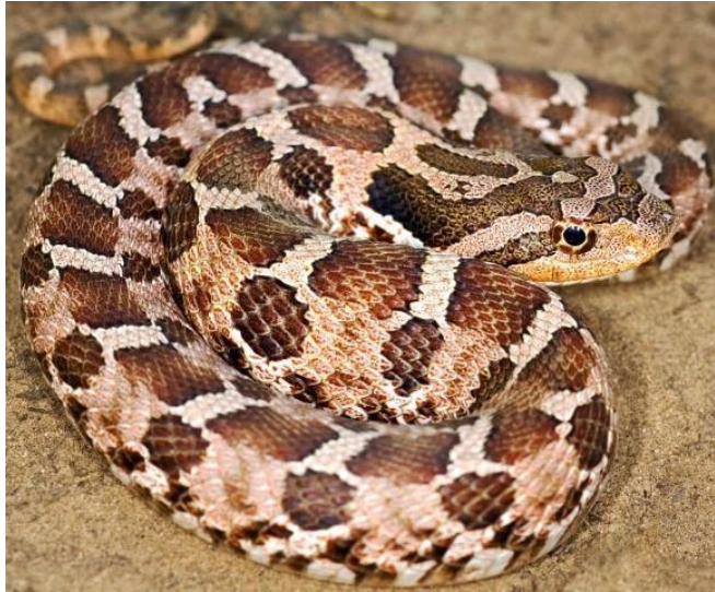
Figure 12. Eastern Hognose Snake Heterodon platirhinos

An uncommon species, the eastern hognose snake is nonvenomous and frequently displays a death-feigning act if threatened. Preferring habitat with sandy soil, its diet consists primarily of toads and occasionally frogs. Young eastern hognose snakes may also eat crickets and other insects. Its snout is upturned and is used to dig up toads. The color of this species is variable, ranging from black to dark green or light brown.