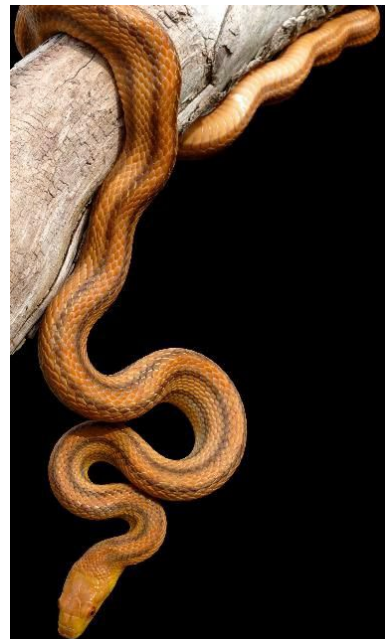
Figure 24. Yellow Rat Snake Elaphe obsoleta quadrivittata

This common snake is non-venomous and may bite if threatened. The yellow rat snake is often seen in trees but can be found in a wide variety of habitats. Its diet consists of mostly rats, but this species will eat birds, squirrels, and other small mammals. Adult snakes of this species are dull yellow with dark stripes.