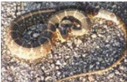
Figure 6. Florida Water Snake Nerodia fasciata pictiventris