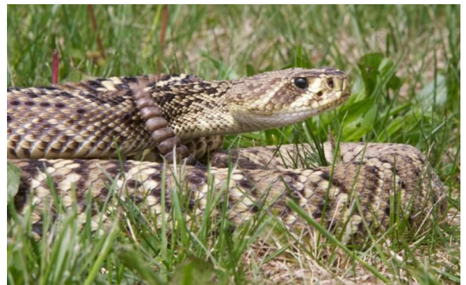
Figure 33. Eastern Diamondback Rattlesnake Crotalus adamanteus

This uncommon rattlesnake is highly venomous and may bite if threatened. Upland wooded areas is its preferred habitat, but the eastern diamondback rattlesnake can be found almost anywhere. Its diet consists of marsh rabbits and cottontails as well as other small mammals. It has dark diamonds edged in white on its back.