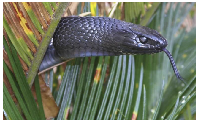
Figure 21. Eastern Indigo Snake Drymarchon corais couperi