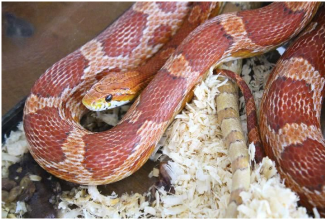
Figure 22. Corn Snake Elaphe guttata guttata

rodents, lizards, birds, and frogs. This snake is usually variegated orange, gray and tan with reddish sides; sometimes exhibiting shades of gray and black.