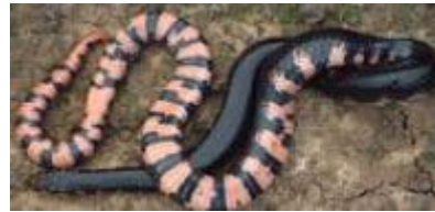
Figure 15. Eastern Mud Snake Farancia abacura abacura

The eastern mud snake is a common, nonvenomous species and does not bite. Inhabiting most freshwater environments, especially swampy areas with vegetation, its prey consists of eel-like salamanders such as Amphiumas. It will sometimes eat sirens, frogs, or fish. This snake is bluish-black with numerous red bars extending from the belly up the side. When first caught, the eastern mud snake may poke the handler with its tail.