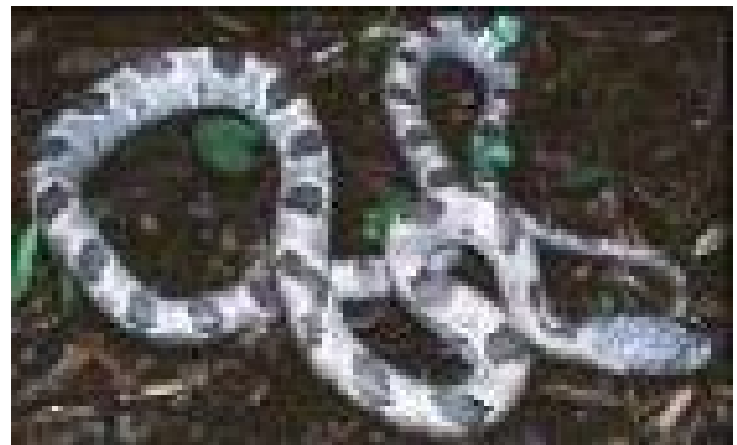
Figure 25. Juvenile Yellow Rat Snake Elaphe obsoleta quadrivittata