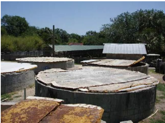
Figure 15. Darkened, climatically controlled, cement ponds provided for hatchlings and grow out animals.

Hatchlings generally emerge at a length of 12–30 cm depending on the species (Lang 1987a; Webb and Manolis 1989). They should be placed in a darkened rearing enclosure with shallow, heated water at between 30–33°C, with the option to increase their body temperature to 35°C (Webb and Manolis 1989; Smith and Marais 1994) (Figure 10 and Figure 15). Temperatures above 36°C or below 28°C have been found to significantly increase stress levels and mortality in hatchlings and should be avoided (Turton 1994). Tanks can be concrete or plastic with simple and effective drainage and a constant warm temperature (Elsey et al. 1994; Mayer et al. 1998). Hide boards can also be used to provide cover and help reduce stress.