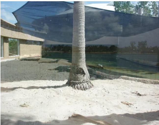
Figure 12. Simple enclosure with sand substrate, shade cloth, and all areas visible.

Suitable options for ground cover include grass or fine sand (Britton 2001; Ziegler 2001) (Figure 7 and Figure 12). These substrates will drain well and provide a non-abrasive surface for the crocodiles. Many types of soil provide adequate results as long as they drain and dry quickly (Britton 2001). Animals kept in a constantly damp, poorly drained environment are subject to a high possibility of bacterial infection (Ziegler 2001). Substrates such as rock and woodchips can cause intestinal blockage if ingested and provide a breeding ground for bacteria (Ziegler 2001). Enclosures can be sparsely or densely planted so long as adequate shade is provided for all animals (Britton 2001) (Figure 7 and Figure 12).