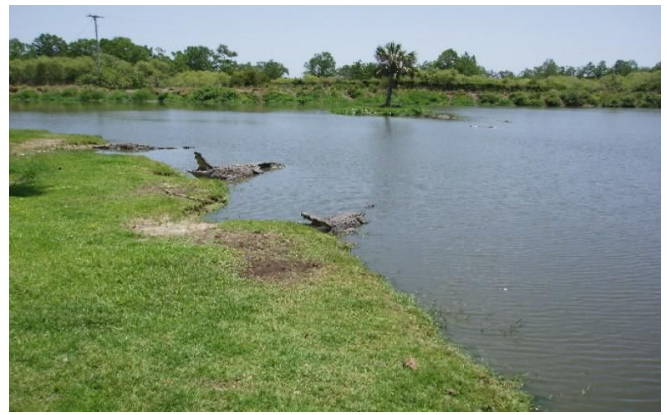
Figure 2. Natural-style pond more suited to adults.