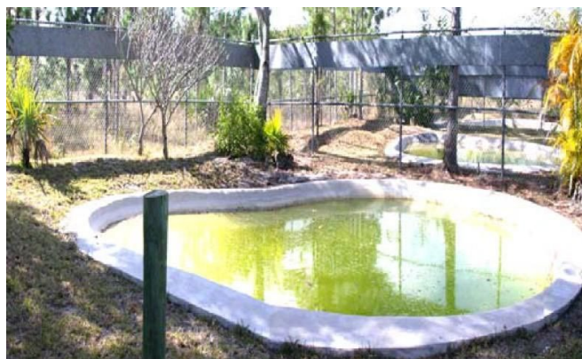
Figure 1. Shallow concrete pond, recommended for one or two adults or several juveniles.

There are a number of options for housing captive crocodilians that can be adapted to suit the individual goals of any facility, such as acres of lake and marsh habitat enclosed to house many animals or as small pens used for one or two individuals (Figure 1 and Figure 2). Adult crocodilians require a great deal of space, and, considering their longevity (often 50 years or more) and large adult size (Thorbjarnarson 1992), careful planning for future housing needs of the facility should be at the forefront of enclosure design. Careful and comprehensive planning becomes even more important when the facility is intended to house "nuisance" crocodiles. In these cases the number of animals requiring space may increase significantly and unpredictably over several years.