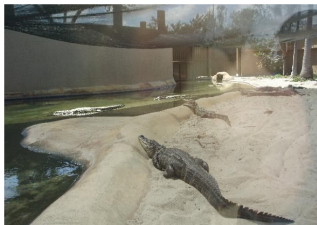
Figure 9. Enclosure including pond with multiple haul-out areas, irregular shape and smooth surface.

The design of the water feature within the enclosure must be carefully considered, since feeding, thermoregulation, and breeding and other social interactions in crocodilians are all focused on the aquatic environment (Lang 1987a). The shape, size, and clarity of the pool will determine the level of safety for keepers, the ease of maintenance, and the quality of public viewing. The water area should cover 50% of the total enclosure, leaving enough dry land area for all specimens to haul out while at least half the available dry land remains unoccupied (Vernon 1994; Ziegler 2001) (Figure 9). Keep in mind that landscape features such as logs, tree clumps, or other impassable vegetation reduce the amount of land area available for use by the animals, and enclosure size should be adjusted to compensate for this (Britton 2001; Ziegler 2001).