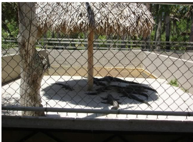
Figure 4. Crocodilian off-exhibit enclosure. Not open to the public.