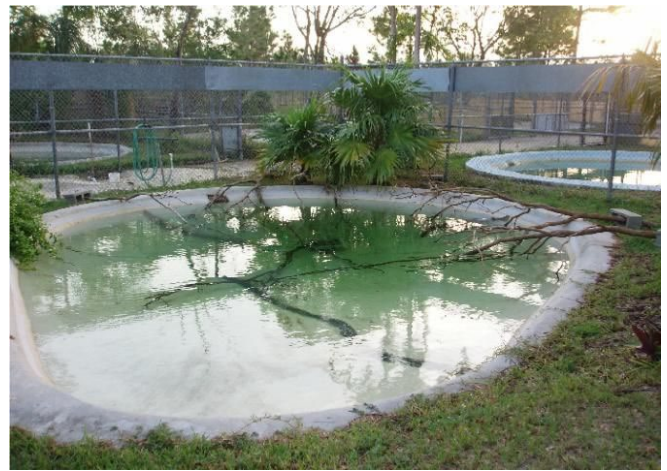
Figure 11. Enclosure with a regular-shaped pond with logs and branches to create barriers.