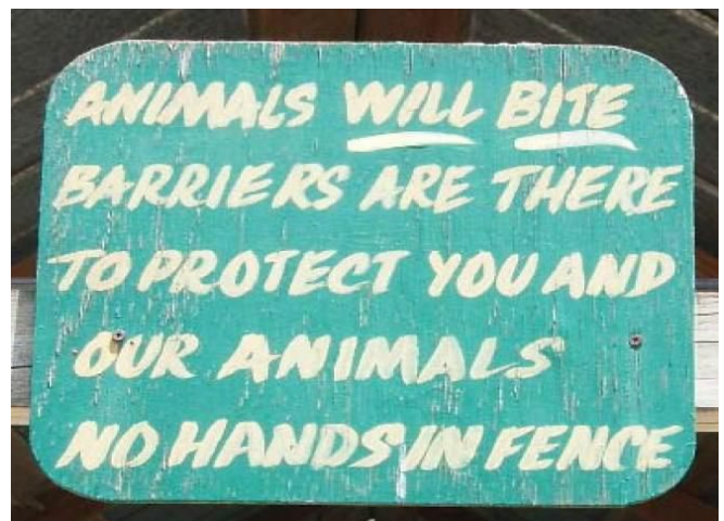
Figure 13. Signs reinforcing safety should be placed throughout any facility open to the public.

All the guidelines presented in this paper, particularly regarding construction, have been designed to achieve a high level of safety and minimize risk of negative human-crocodile interactions within a facility. However, crocodiles are large, unpredictable, fast, powerfully strong predators, so it is the responsibility of the facility to ensure that all staff are appropriately trained (QLD 1997). Caution and safe practices should always be executed and reinforced with staff to prevent laxness. If the facility offers an exhibition section, inevitably children will be present at times. Staff should always be vigilant about monitoring visitor behavior and ensuring rules regarding safety are strictly adhered to (Table 1 and Figure 13). It is also essential that the construction of the "exhibit" enclosure ensure that visitors can not come in to direct contact with the crocodiles (QLD 1997). This can be assured by including an extra "safety" barrier or fence around the actual fence of the enclosure (Whitaker and Andrews 1998).