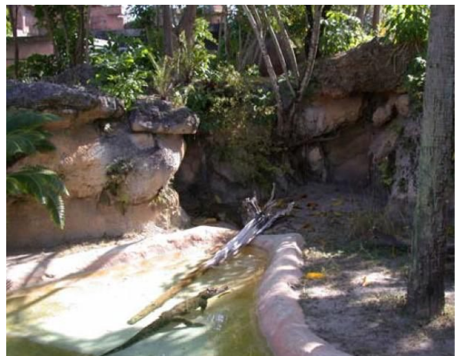
Figure 3. Crocodilian exhibit enclosure. Open to the public.

Enclosures can be designed for exhibit. Exhibit enclosures are those intended to provide ample viewing opportunities for public observation of the animals. They require the most careful planning and construction. Enclosures that are used to house animals not intended for public display (e.g., breeding, rearing, and holding) can often be constructed with less financial investment. Both enclosure types share similar minimal requirements of providing safe and secure confinement in a manner that also provides for the health and well-being of crocodiles (QLD 1997; Ziegler 2001). Exhibit enclosures must also account for public safety and be aesthetically pleasing (Figure 3). Off-exhibit enclosures can often be far more utilitarian in terms of landscape design and orientation (Figure 4). Off-exhibit enclosures can generally be designed to accommodate more individuals while requiring lower construction and maintenance costs (Ziegler 2001).