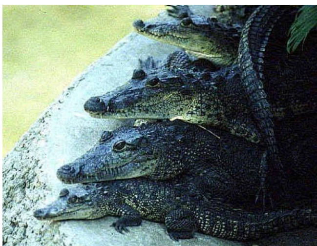
Figure 6. Morelet's crocodiles ( Crocodylus moreletti ).