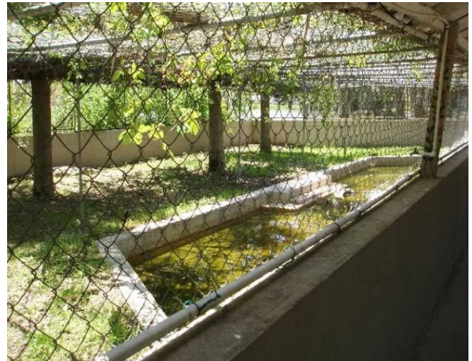
Figure 7. Simple enclosure with grass/soil substrate, sturdy trees, adequate shade from trees, and all areas visible.

back of an enclosure while chain link is used at the viewing areas (Figure 4). Another excellent option for relatively small enclosures is to build a short block wall with chain link extending above to provide easy viewing and improved safety (Ziegler 2001) (Figure 7). Using chain link with a green vinyl coating, if available, can be more attractive.