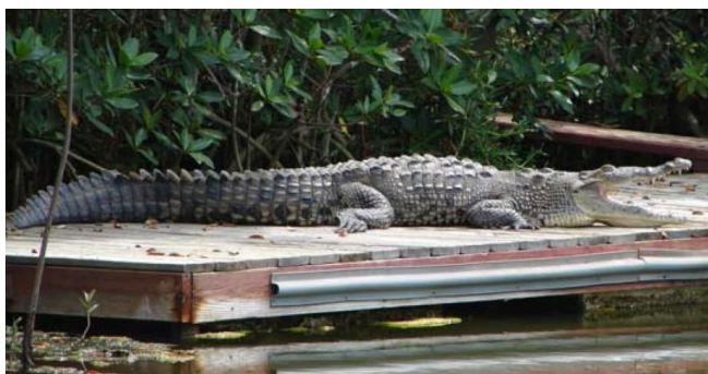
Figure 5. American crocodile ( Crocodylus acutus ).

acutus and C. moreletti have been successfully housed and bred in captivity (Groombridge 1987; Lang 1987; Ojeda et al. 1998). Both species possess a commercially high-quality skin, are relatively non-aggressive, and have been found to demonstrate a high tolerance of conspecifics (Lang 1987a; Thorbjarnarson 1992). Due to the high quality of their skin, both species have been targeted extensively by hunters, leading to their classification under Appendix 1 (CITES), and they are considered endangered (Thorbjarnarson 1992).