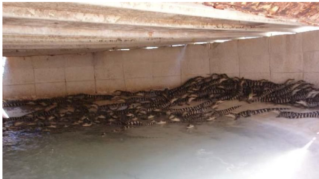
Figure 10. Hatchling alligators housed together in shallow ponds with smooth surface.

it is often best to use two or more cement ponds in an enclosure (Hutton and Jaarsveldt 1987; Pooley 1990). This will enable each pond to be cleaned alternately to avoid displacing all crocodiles from the water each time, thus reducing stress (Hutton and Jaarsveldt 1987; Pooley 1990). They can then also be cleaned more thoroughly (Child 1987). The pond(s) should typically be around 10-15 m long by 1.5 m wide and 60-100 cm deep (Ziegler 2001).