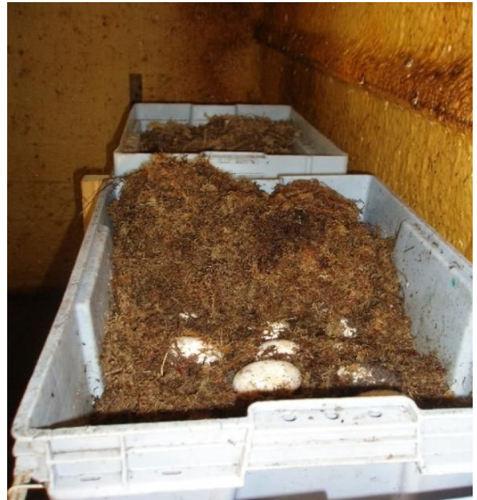
Figure 14. Eggs placed in moist, warm, artificially controlled incubation chamber.

(Hibberd 1994; Hutton and Webb 1994). However, eggs do not require a substrate if precisely controlled environmental conditions can be achieved (Webb and Manolis 1989).