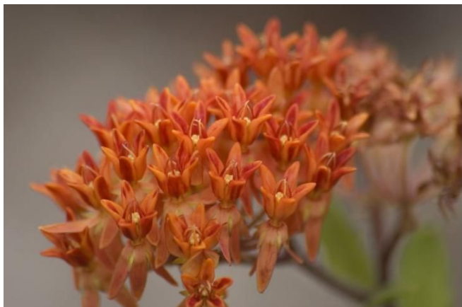
Figure 4. Florida has several native species of milkweeds, such as butterflyweed ( Asclepias tuberosa ).

There may not be enough milkweed habitats left to sustain monarch populations at earlier levels. While year-to-year counts of monarchs vary widely, the World Wildlife Fund-Mexico has detected a downward trend in size of the Mexico winter colonies since the mid-1990s. In addition to loss of milkweeds throughout North America, illegal logging of forests on the Mexican wintering grounds is a major threat to the population.