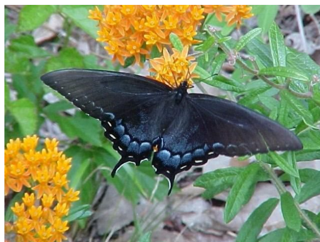
Figure 5. Native milkweed species play host to many butterfly species, such as this dark-morph female tiger swallowtail on butterflyweed.

In addition to milkweeds, a monarch garden needs nectar plants to provide food for adult monarchs. See sidebar for a list of nectar plants that are native to south Florida.