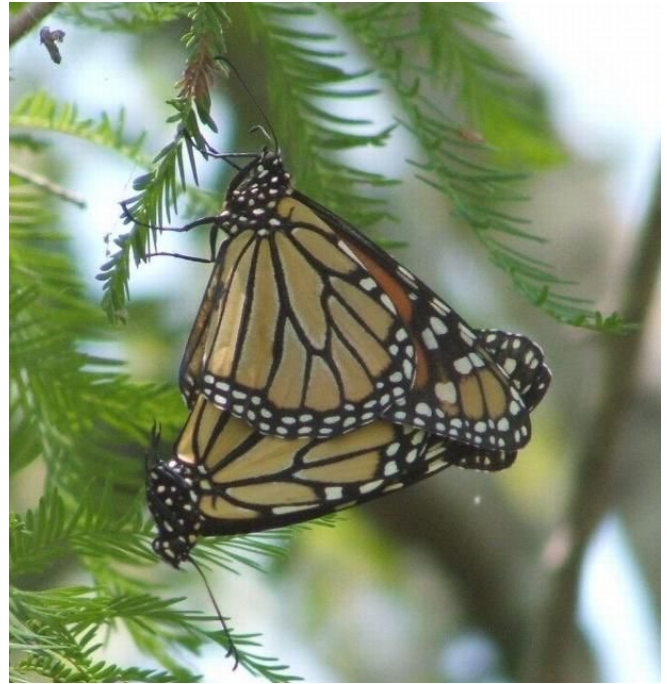
Figure 3. Monarchs may migrate to Florida from the northeastern U.S. and Canada, then stay here and breed year-round.

It is also possible that Florida is a stopover for migrating monarchs on their way to the Mexican wintering grounds (Figure 2). Migration from Florida to Mexico remains largely hypothetical, but researcher Gary Noel Ross has observed thousands of monarchs on oil platforms in the central Gulf of Mexico, indicating that they cross from Louisiana to northeastern Mexico each fall. However, a recent study by Elizabeth Howard and Andrew Davis found that monarch roosts along the East Coast flyway lagged behind roosts in the central U.S. flyway, suggesting that monarchs migrating down the East Coast are less likely to make it to the Mexico wintering site. Christina Dockx and colleagues contend that monarchs found in St. Marks National Wildlife Refuge (Florida panhandle) are heading to Mexico, whereas those found in southern Florida spend their winters either in southern Florida, Cuba, or other areas of the Caribbean.