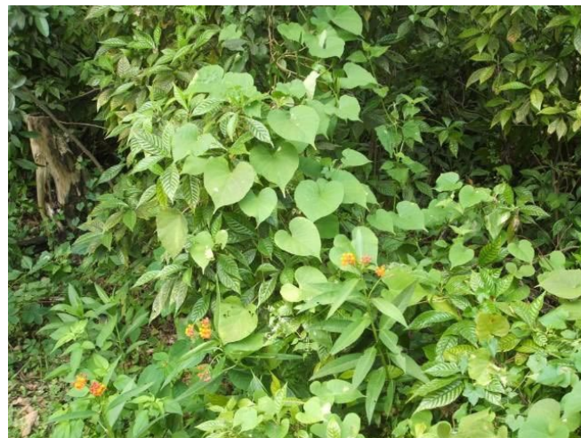
Figure 6. Scarlet milkweed ( Asclepias curassavica ) invading a natural area in Coconut Creek Maple Swamp, Broward County, Florida.

Other plants that should be avoided in the monarch garden are swallow-worts (genus Cynanchum ). These plants have similar chemical properties to milkweeds and fool monarchs into laying eggs on them. However, swallow-worts are not suitable food for monarch larvae, and caterpillars fail to develop into pupae when feeding on these plants. In south Florida there are four native species of Cynanchum .