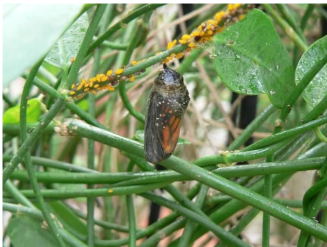
Figure 7. Monarch chrysalis on native white vine ( Sarcostemma clausum ) in south Florida.

Credit: Sandy Granson, University of Florida