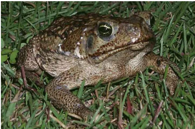
Figure 6. Cane toad ( Rhinella marina , formerly Bufo marinus ).

introduction, impacts of this invasive species could have been avoided (Bomford et al. 2005).