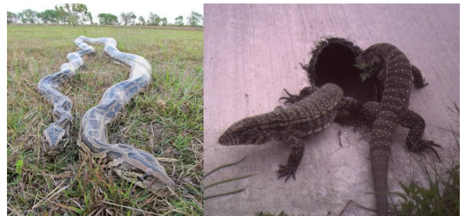
Figure 2. The Burmese python ( Python molurus bivittatus , left) and Argentine black and white tegu ( Salvator merianae , right) already have established populations in Florida. These predators threaten native wildlife and have the potential to disrupt entire ecological communities.

action is needed to prevent other potentially destructive species from establishing (Figure 3).