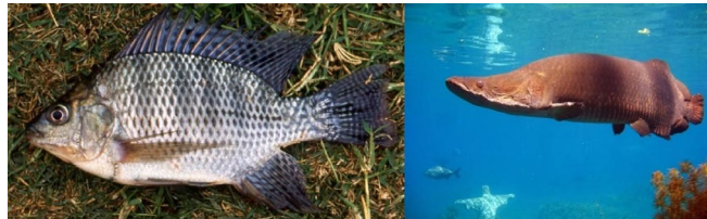
Figure 8. The Fish Invasiveness Screening Kit (FISK) has been used to identify high-risk fish species in Florida such as the Nile tilapia ( Oreochromis niloticus , left) and Arapaima ( Arapaima gigas , right).

peer-reviewed approach to assess species based on their biogeography, ecology, history, and potential invasiveness. FISK initially focused on freshwater fish in the British Isles and other temperate-zone countries and has been modified for use in Florida and other warm regions (Lawson et al. 2013; Figure 5). The FISK tool has been used to support regulatory decisions in Florida (Hill and Lawson 2015). The kit has also been adapted for amphibians (AmphISK), marine fish (MFISK), and marine and freshwater invertebrates (MI-ISK and FI-ISK).