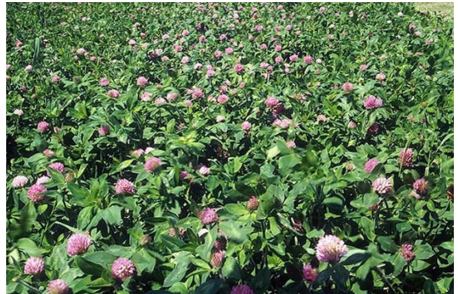
Figure 4. Red clover ( Trifolium pratense ).

The UF/IFAS Assessment of Non-native Plants in Florida's Natural Areas ( assessment.ifas.ufl.edu ) uses the WRA to evaluate invasion risk of introduced and proposed nonnative plant species in Florida.