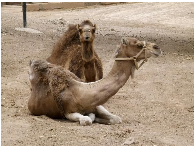
Figure 7. Arabian camel ( Camelus dromedarius ).

Camels ( Camelus dromedarius ) were assessed prior to their introduction into New Zealand for a tourism venture. A quantitative risk assessment of exotic vertebrates considered propagule pressure, climate match, history of establishment elsewhere, and taxonomic group (Bomford 2008). Camels were deemed unlikely to establish wild populations but posed risks to native vegetation, human culture, and health. The analysis prevented mass importation of camels. Only a small number of camels have since been imported with special permits and regulations.