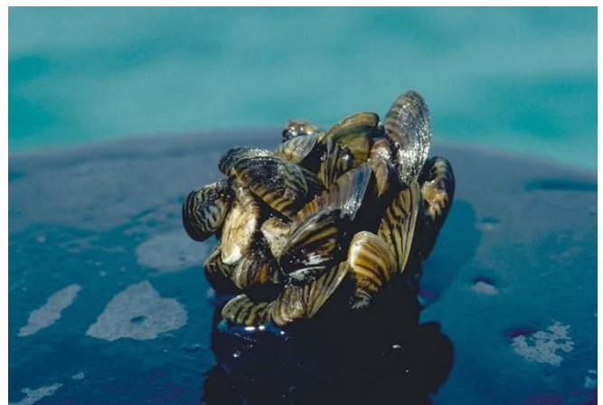
Figure 5. Zebra mussels ( Dreissena polymorpha ).

Research on zebra mussels ( Dreissena polymorpha ) in the Great Lakes of the United States highlighted invasion pathways, identified other high-risk species and vulnerable areas, and recommended preventative measures (Kolar and Lodge 2002). Impacts were assessed using quantitative models based on regression analysis of data from multiple invaded sites (Ricciardi 2003). This pioneering work has led to development of risk-assessment models for other taxa.