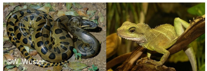
Figure 3. The green anaconda ( Eunectes murinus , left) and Chinese water dragon ( Physignathus cocincinus , right) have been found in the wild in Florida, but with no evidence of breeding. If they establish, these species could have severe ecological impacts.