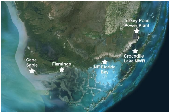
Figure 2. Important locations for American crocodiles in Florida.