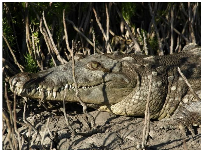
Figure 1. American crocodile ( Crocodylus acutus ).

The American crocodile ( Crocodylus acutus ) (Figure 1) is a top predator that lives along the southern tip of peninsular Florida. Crocodiles inhabit saltwater, brackish water, or freshwater near coastal areas in mangrove-lined ponds, creeks, coves, man-made ponds, and canals. In 1975, the American crocodile was federally listed as an endangered species. Conservation and management have helped the south Florida crocodile population rebound, resulting in its downlisting to threatened in 2007. However, habitat modification and decreased freshwater flow to estuaries still present ongoing concerns for this threatened species.