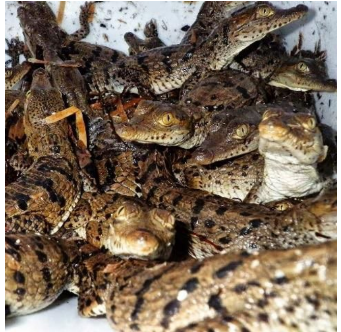
Figure 3. Hatchling American crocodiles ( Crocodylus acutus ).

nesting sites (Figure 3). Hatchling survival decreases with increasing distance that hatchlings have to travel to nursery habitat with suitable salinities. In northeastern Florida Bay, the most successful natural nesting areas are often kilometers away from good nursery habitat. Thus, the combination of saline water and long dispersal distances limits hatchling growth and survival in this location.