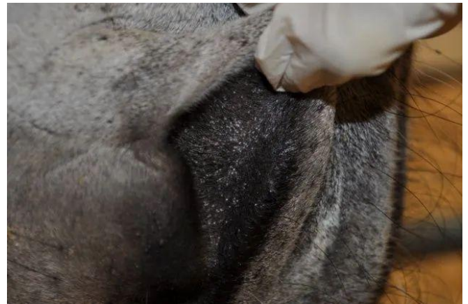
Figure 1. Besnoitia cysts visible as tiny white nodules in the nostrils of a donkey with besnoitiosis.

donkeys (Figure 3). Affected donkeys often have a history of chronic dermatitis (skin disease) that does not respond to treatment with antibiotics, ointments, medicated baths, and other typical skin remedies.