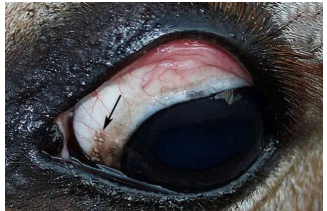
Figure 2. Scleral pearls (arrow) noted on the sclera of the eye in a donkey with besnoitiosis.