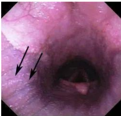
Figure 3. Endoscopic image of Besnoitia cysts (arrows) in the airway of a donkey with besnoitiosis.

In an epidemiologic investigation of 416 donkeys from herds across the United States, young animals (median age 24 months) were at increased risk of developing besnoitiosis compared to older individuals. The most common lesions in infected donkeys were cysts in the nares (94%) and scleral pearls (81%) (Ness et al. 2014). Some infected animals remain otherwise healthy, while others appear to suffer weight loss and fail to thrive due to the disease. There are reports of Besnoitia infection in European cattle leading to severe illness and death, but this severe form of besnoitiosis has not been observed in donkeys (Olias, Schade, and Mehlhorn 2011; Jacquiet, Liénard, and Franc 2010; Schares et al. 2010).