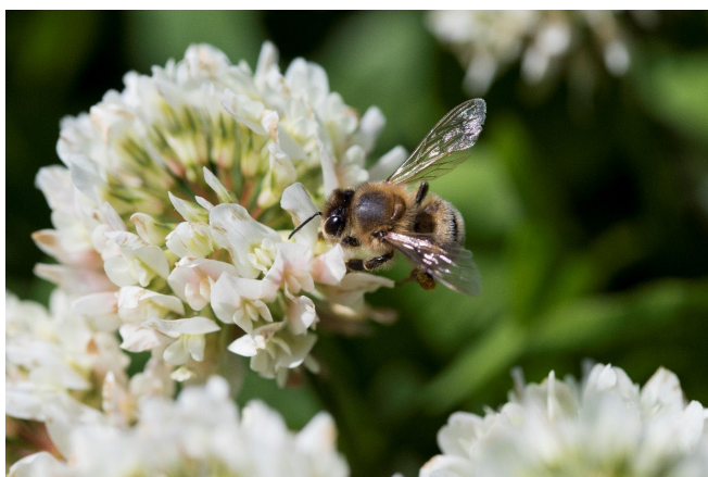
Figure 1. Residents can include a variety of plants and even trees like this white redbud in their yards to conserve pollinators.

Protecting and supporting pollinators—especially bees—is critical to conserve environmental resources and ensure the health of humankind (Gill et al., 2016; Klein et al., 2018; Patel et al., 2020). Increasing urbanization and development of managed landscapes can harm pollinators by reducing flowers and vegetation and increasing exposure to chemicals (Baldock, 2020; Chaote et al., 2018). However, research shows that urban, developed landscapes can be designed and maintained to successfully provide habitats for diverse, healthy pollinator populations, including bees (Baldock, 2020; Fetridge et al., 2008; Theodorou et al., 2020). Thus, a major opportunity and need exist for residents, particularly those living in urban areas, to support bees and other pollinators by adopting pollinator gardening in their landscapes (Baldock, 2020; Burr et al., 2018). Based on recent research about significant barriers and solutions, this publication serves to guide Extension professionals and other practitioners to best encourage and facilitate adoption of pollinator gardening by addressing residents' perceptions.