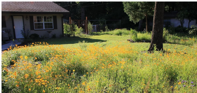
Figure 2. A residential pollinator garden with wildflowers in peak bloom.